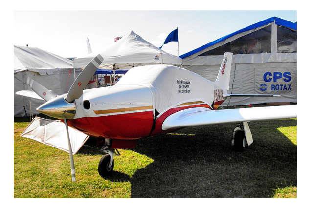
Ravin 500 Standard Canopy Cover