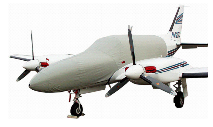
Covers & Plugs for the Aero Commander 700