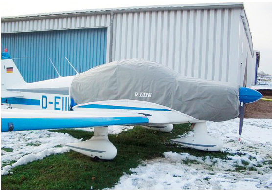
Robin R.2160 Canopy/Engine Cover

This cover type is made from Silver Acrylic Sunbrella canvas and is 100% lined with a soft and smooth microfiber. Bruce's Custom Covers developed this material combination especially for aircraft protection. The outer material is medium weight and treated for water resistance, UV resistance and anti-static buildup. The inner lining is a very soft and smooth microfiber to prevent scratching. The material is very reflective, and tests show that the cabin interior temperature can be reduced to near-ambient temperature on the hottest of days. It is water, ice and snow repellent, yet breathable to allow moisture to escape from between the cover and the aircraft surface.