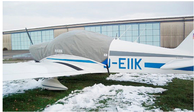
Robin R.2160 Canopy/Engine Cover