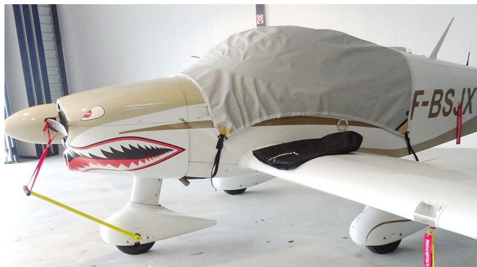
Robin DR300 Travel Cover