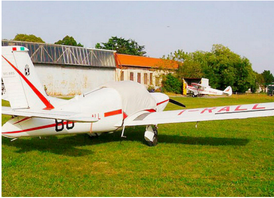
Standard Canopy Cover for MS893A

The Aerospatiale (Socata) Rallye 150 Canopy/Engine Cover is a one-piece cover (100% lined with microfiber) that is a combination of the Canopy Cover and Engine Cover. This cover will enclose the engine cowl and will extend aft to cover all of the windows. This cover type is made from Silver Acrylic Sunbrella canvas and is 100% lined with a soft and smooth microfiber. Bruce's Custom Covers developed this material combination especially for aircraft protection. The outer material is medium weight and treated for water resistance, UV resistance and anti-static buildup. The inner lining is a very soft and smooth microfiber to prevent scratching. The material is very reflective, and tests show that the cabin interior temperature can be reduced to near-ambient temperature on the hottest of days. It is water, ice and snow repellent, yet breathable to allow moisture to escape from between the cover and the aircraft surface.