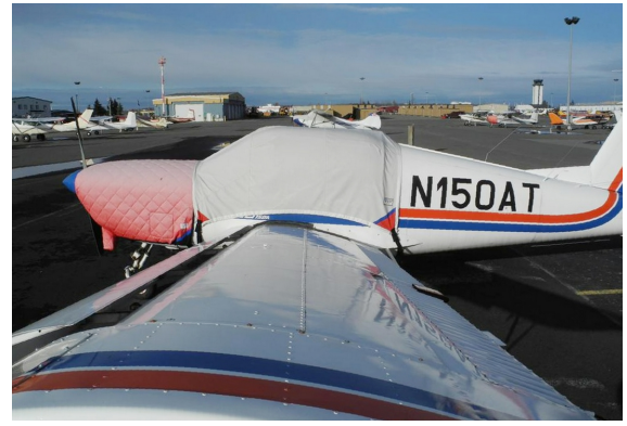
Kolibier 150A Canopy Cover, Insulated Engine Cover