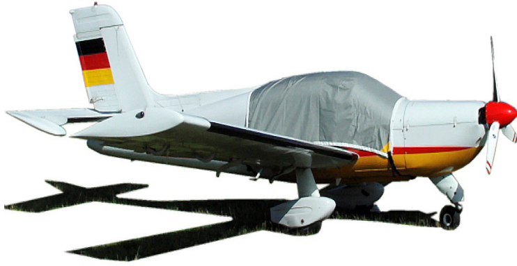
Rallye 150 Canopy Cover

The Aerospatiale (Socata) Rallye 150 Canopy/Engine Cover is a one-piece cover (100% lined with microfiber) that is a combination of the Canopy Cover and Engine Cover. This cover will enclose the engine cowl and will extend aft to cover all of the windows. This cover type is made from Silver Acrylic Sunbrella canvas and is 100% lined with a soft and smooth microfiber. Bruce's Custom Covers developed this material combination especially for aircraft protection. The outer material is medium weight and treated for water resistance, UV resistance and anti-static buildup. The inner lining is a very soft and smooth microfiber to prevent scratching. The material is very reflective, and tests show that the cabin interior temperature can be reduced to near-ambient temperature on the hottest of days. It is water, ice and snow repellent, yet breathable to allow moisture to escape from between the cover and the aircraft surface.