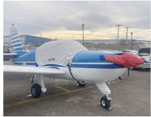
SOCATA Rallye 150 Canopy Cover, Prop Cover