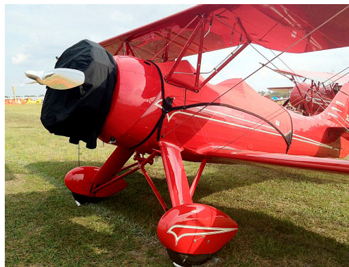
Waco UPF-7 Canopy & Engine Cover