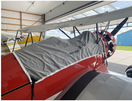
Waco QCF-2 Travel Weight Canopy Cover