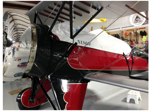
Waco QCF/UBF Canopy Cover