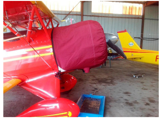
Waco Engine Cover