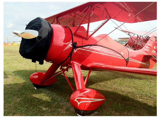
Waco UPF-7 Canopy & Engine Cover