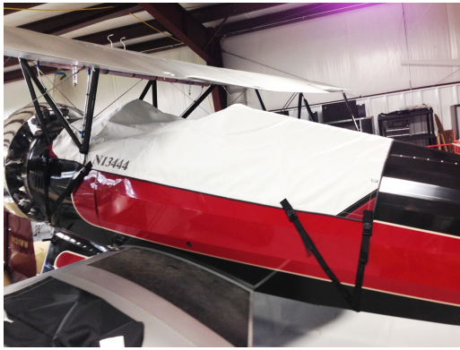
Waco QCF/UBF Canopy Cover