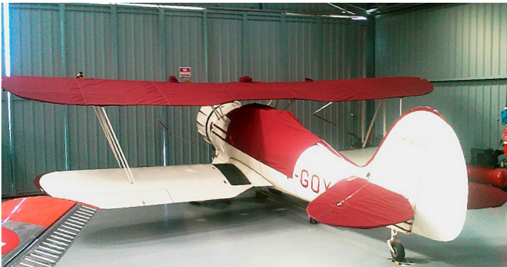
Waco UPF-7 Upper/Lower Wing Cover, Horizontal Stabilizer Cover, & Canopy Cover