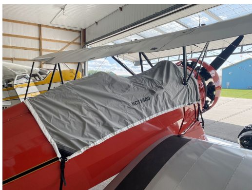
Waco QCF-2 Travel Weight Canopy Cover