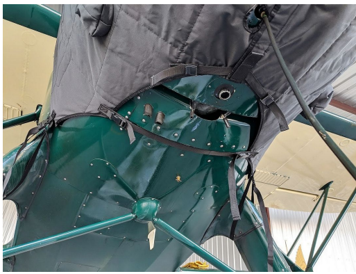
Wacon Cabin Biplane ZQC-6 Insulated Engine Cover