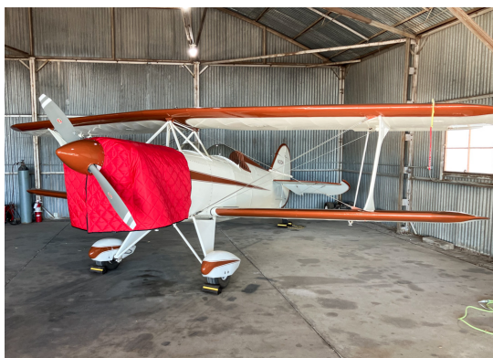
SKYBOLT, Insulated Hangar Blanket, Custom Fit Interior Use)