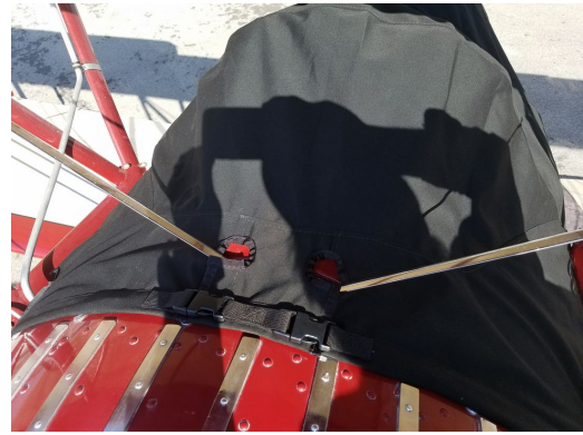
Waco UPF-7 Canopy Cover