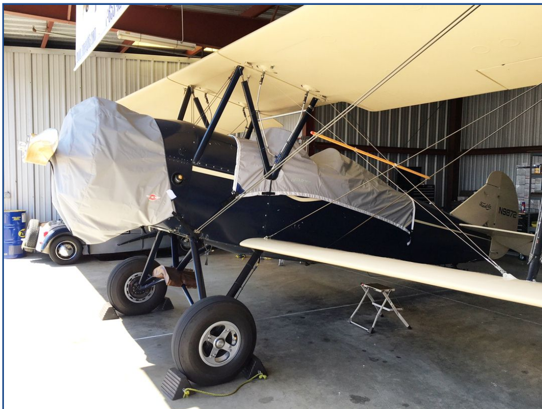
Travel Air 4000 Canopy and Engine Covers, light weight travel type