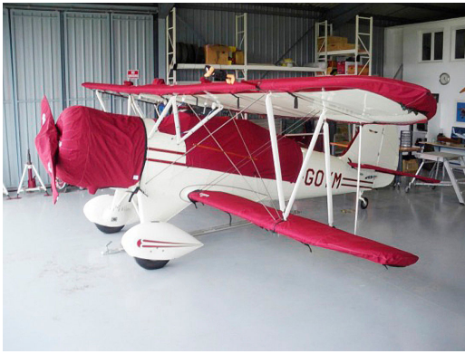
Waco UPF-7 Canopy, Wings, Stab's, Engine, Prop Covers