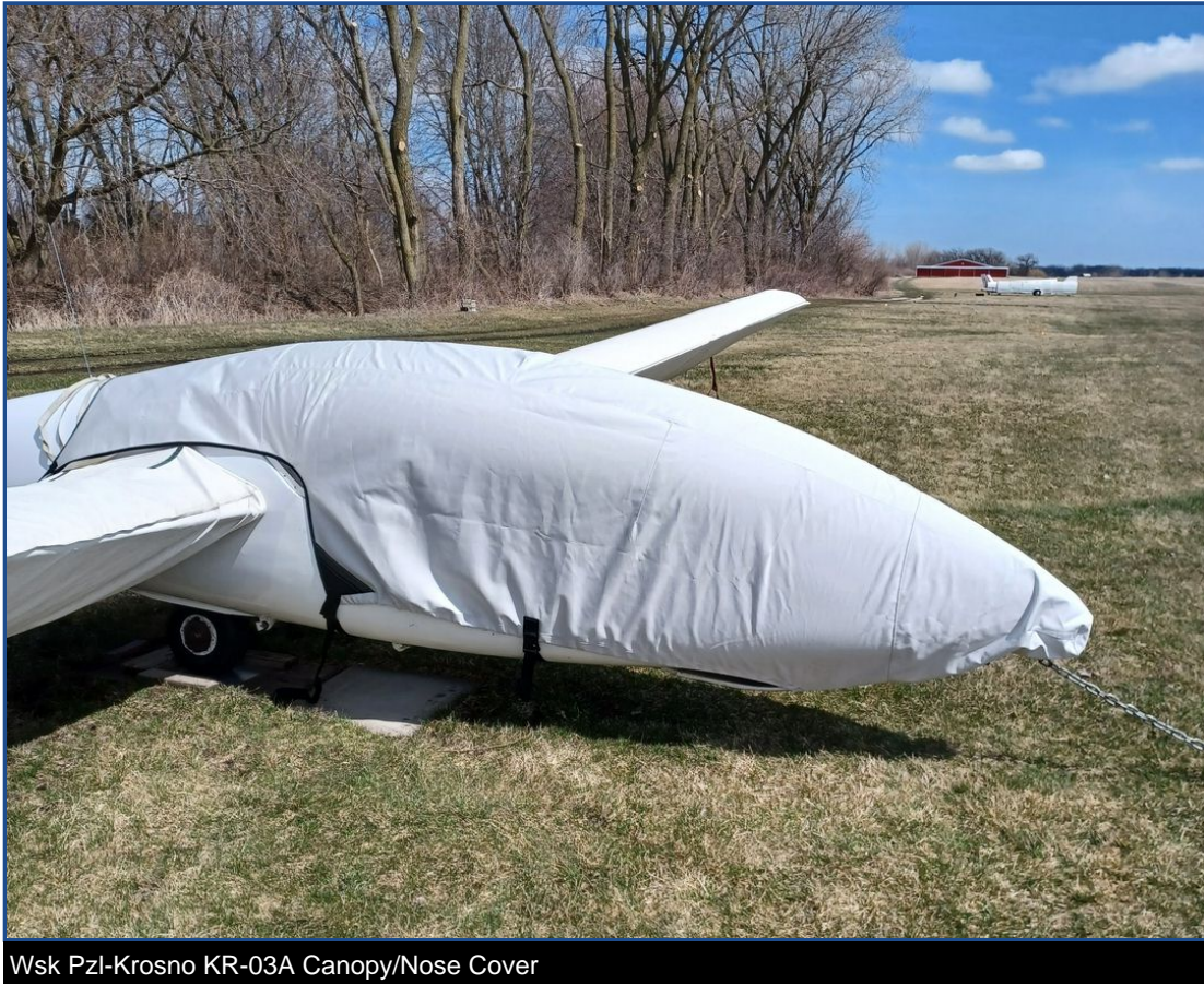
Wsk Pzl-Krosno KR-03A Canopy/Nose Cover