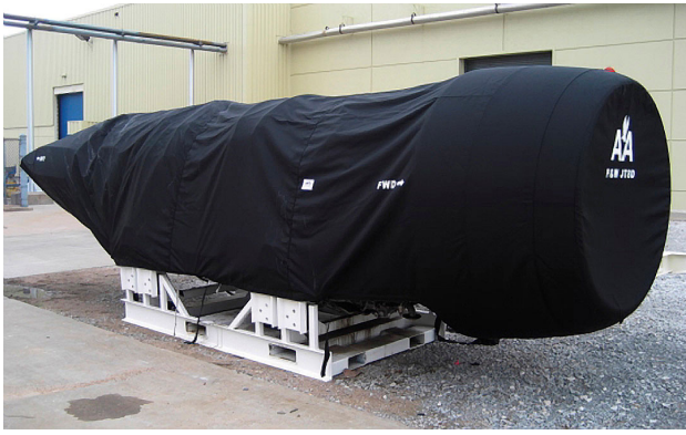
PW JT8D Off-Link Protective Long-term Storage "Rain Cap" Style Engine Cover