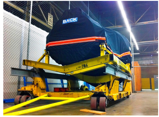
PW JT9D Series Off-Link Engine Transport Cover, Fully Enclosed, P/N: PW-120