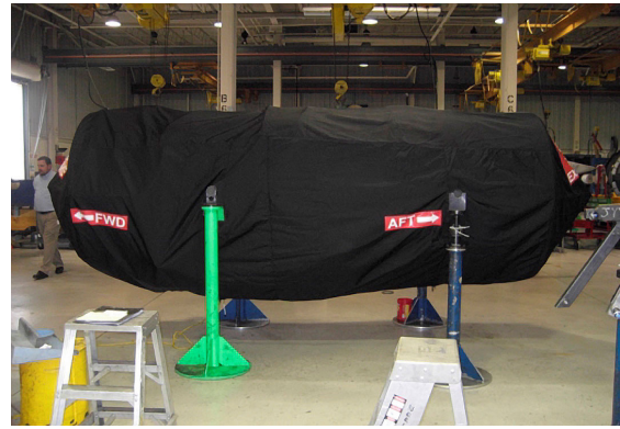
PW JT8D Off-Link Engine Transport Cover (no nose cone, no TR's), fully enclosed