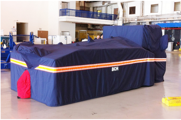
Complete Cover for Eagle Tug