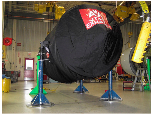
CFM56-5B Off Link Cover, fully enclosed PW JT8D Off-Link Engine Transport Cover (no nose cone, no TR's), fully enclosed