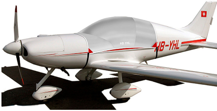
Pulsar Canopy Cover (illustration)

This cover type is made from Silver Acrylic Sunbrella canvas and is 100% lined with a soft and smooth microfiber. Bruce's Custom Covers developed this material combination especially for aircraft protection. The outer material is medium weight and treated for water resistance, UV resistance and anti-static buildup. The inner lining is a very soft and smooth microfiber to prevent scratching. The material is very reflective, and tests show that the cabin interior temperature can be reduced to near-ambient temperature on the hottest of days. It is water, ice and snow repellent, yet breathable to allow moisture to escape from between the cover and the aircraft surface.