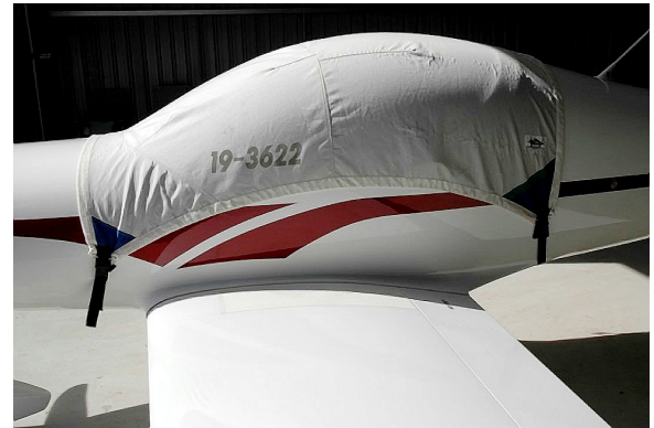
Pulsar Canopy Cover