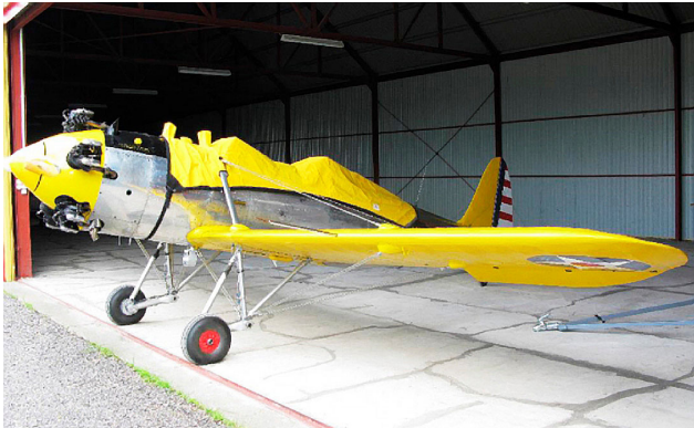
Ryan PT22 Canopy Cover

This cover type is made from Silver Acrylic Sunbrella canvas and is 100% lined with a soft and smooth microfiber. Bruce's Custom Covers developed this material combination especially for aircraft protection. The outer material is medium weight and treated for water resistance, UV resistance and anti-static buildup. The inner lining is a very soft and smooth microfiber to prevent scratching. The material is very reflective, and tests show that the cabin interior temperature can be reduced to near-ambient temperature on the hottest of days. It is water, ice and snow repellent, yet breathable to allow moisture to escape from between the cover and the aircraft surface.