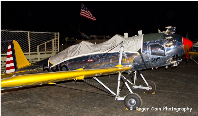
Ryan PT-22 Canopy Cover

Travel Covers are made with Silver Solution-Dyed Polyester fabric and only lined over the windshield to save weight. The material is lightweight and more compact for easy stowage in the aircraft. The polyester material is water resistant, but only intended for occasional use outside. We also have an ultra lightweight material available for fitted hangar dust covers. For daily outdoor use, the non-travel Sunbrella Cover is the best choice.