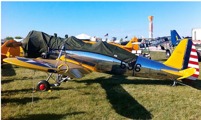
Ryan PT-22 ST3KR Canopy Cover and Engine Cover

water resistance, UV resistance and anti-static buildup. The inner lining is a very soft and smooth microfiber to prevent scratching. The material is very reflective, and tests show that the cabin interior temperature can be reduced to near-ambient temperature on the hottest of days. It is water, ice and snow repellent, yet breathable to allow moisture to escape from between the cover and the aircraft surface.