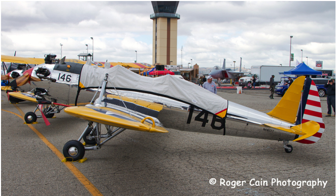
Ryan PT-22 Canopy Cover