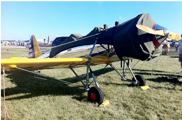
Ryan PT-22 Canopy Cover and Engine Cover