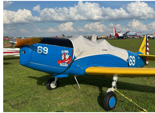
Fairchild PT-19 Canopy Cover