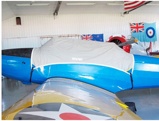
Fairchild PT-26 Canopy Cover