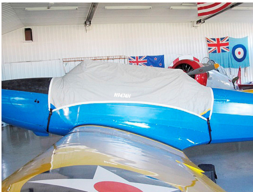
Fairchild PT-26 Canopy Cover

Travel Covers are made with Silver Solution-Dyed Polyester fabric and only lined over the windshield to save weight. The material is lightweight and more compact for easy stowage in the aircraft. The polyester material is water resistant, but only intended for occasional use outside. We also have an ultra lightweight material available for fitted hangar dust covers. For daily outdoor use, the non-travel Sunbrella Cover is the best choice.