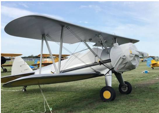
Boeing Stearman PT-13 Engine & Prop Covers (std. color is silver) Stearman Trainer A75 Engine Cover (Continental Engine)