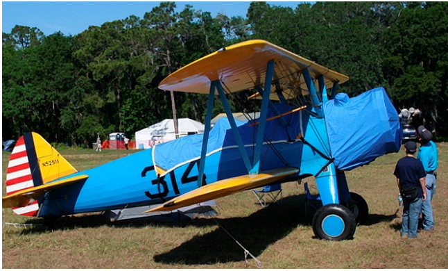
Stearman Canopy & Engine Covers

the hottest of days. It is water, ice and snow repellent, yet breathable to allow moisture to escape from between the cover and the aircraft surface.