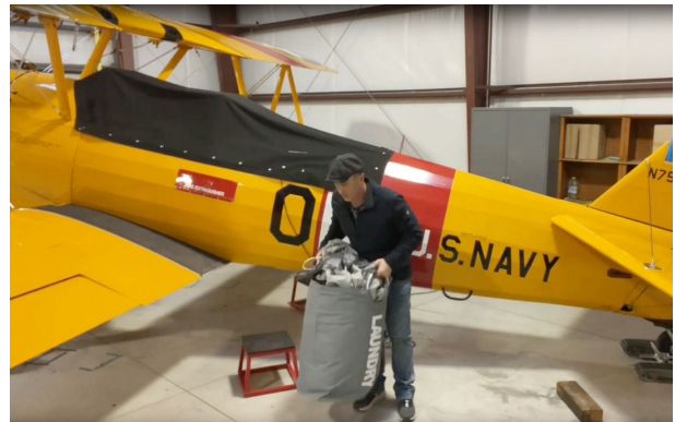
#1: Out of the bag.