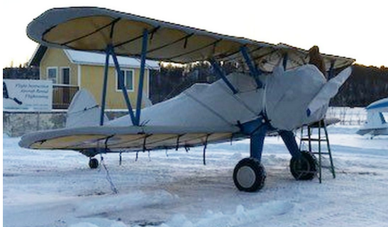
Boeing Stearman PT-13 Winter Cover Set

WINTER USE MATERIAL - Made with Solution-Dyed Polyester fabric, this option is intended for seasonal use to aid in deicing, rain mitigation, or for occasional travel. The material is lighter and more compact, but more susceptible to UV damage and may have a shorter useful life if used continuously outside than the all-year use material.