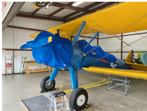
Boeing Stearman PT-13 Canopy, Engine & Prop Covers