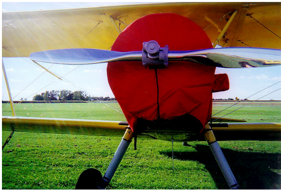
Stearman Engine Cover

the hottest of days. It is water, ice and snow repellent, yet breathable to allow moisture to escape from between the cover and the aircraft surface.