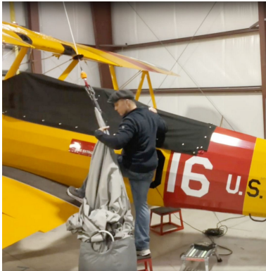
#2: Attach to electric hoist.