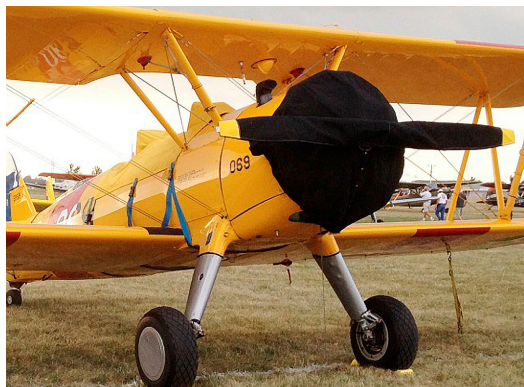
Stearman Canopy & Engine Covers (std. color is silver)

This cover type is made from Silver Acrylic Sunbrella canvas and is 100% lined with a soft and smooth microfiber. Bruce's Custom Covers developed this material combination especially for aircraft protection. The outer material is medium weight and treated for water resistance, UV resistance and anti-static buildup. The inner lining is a very soft and smooth microfiber to prevent scratching. The material is very reflective, and tests show that the cabin interior temperature can be reduced to near-ambient temperature on the hottest of days. It is water, ice and snow repellent, yet breathable to allow moisture to escape from between the cover and the aircraft surface.