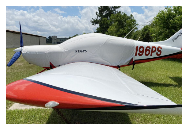
PiperSport Extended Canopy/Engine Cover