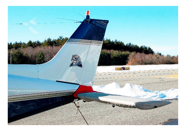
Tailcone & Horizontal Stabilizer Covers