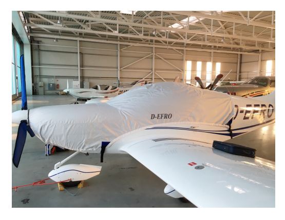
SportCruiser Canopy/Engine Cover

This cover type is made from Silver Acrylic Sunbrella canvas and is 100% lined with a soft and smooth microfiber. Bruce's Custom Covers developed this material combination especially for aircraft protection. The outer material is medium weight and treated for water resistance, UV resistance and anti-static buildup. The inner lining is a very soft and smooth microfiber to prevent scratching. The material is very reflective, and tests show that the cabin interior temperature can be reduced to near-ambient temperature on the hottest of days. It is water, ice and snow repellent, yet breathable to allow moisture to escape from between the cover and the aircraft surface.