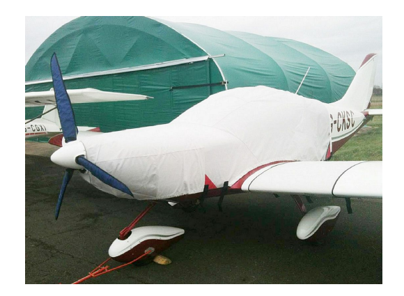
PiperSport Canopy/Engine Cover, Wing Locker Covers

WINTER USE MATERIAL - Made with Solution-Dyed Polyester fabric, this option is intended for seasonal use to aid in deicing, rain mitigation, or for occasional travel. The material is lighter and more compact, but more susceptible to UV damage and may have a shorter useful life if used continuously outside than the all-year use material.