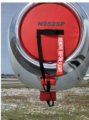
Beech Premier 1A Intake/Exhaust Plug Set

The Hawker Beechcraft Premier 390 Intake/Exhaust Plugs are custom fit for the intake and exhaust openings, made with heavy-duty vinyl material, and stuffed with a single block of sculpted urethane foam. Each plug has a zipper that allows the foam to be removed and dried if necessary. Engine plugs have 'remove before flight' streamers sewn onto the face of the plugs. Most plugs are imprinted with the aircraft registration number in black. Engine plugs may be inserted after flight when the engine is still warm. Engine Inlet Plugs are commonly referred to as Cowl Plugs, Intake Plugs, Cowl Blocks, Engine Blocks, and Engine Bungs.