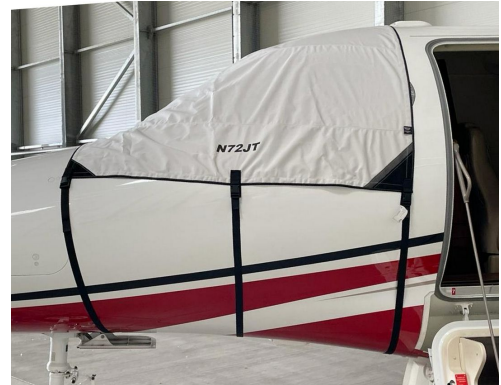
Hawker Premier Cockpit Cover