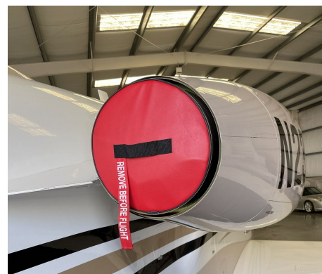
Hawker Beechcraft Premier 390 Intake Plug/Exhaust Plug Set