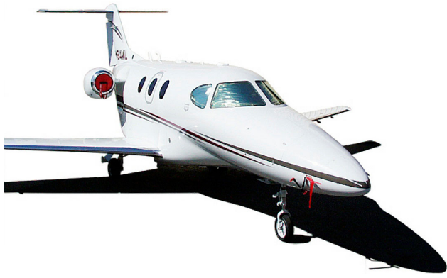
Raytheon Premier Intake Plugs, Pitot Covers & Cockpit HeatShields

Heatshield is an excellent short-term remedy for cockpit overheating, but an external fabric cover is more effective for long-term protection.