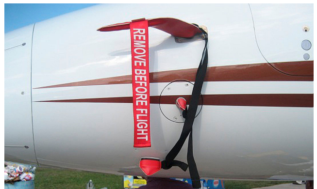
Premier Intake/Exhaust Plug set with Generator Inlet/Exhaust Plugs