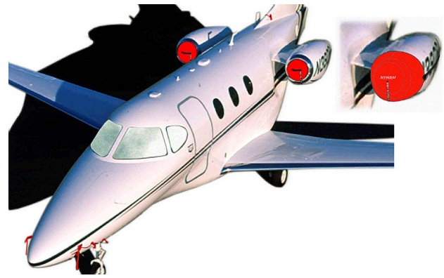
Premier Intake Plugs, Intake Covers, Pitot Covers & Cockpit HeatShields