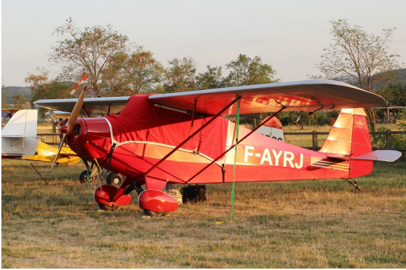
Porterfield Collegiate Canopy Cover

water resistance, UV resistance and anti-static buildup. The inner lining is a very soft and smooth microfiber to prevent scratching. The material is very reflective, and tests show that the cabin interior temperature can be reduced to near-ambient temperature on the hottest of days. It is water, ice and snow repellent, yet breathable to allow moisture to escape from between the cover and the aircraft surface.