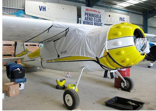
Cessna 195 Canopy Cover, over-top, 24" fwd ext to cover cowl ring gap, gas cap ext.