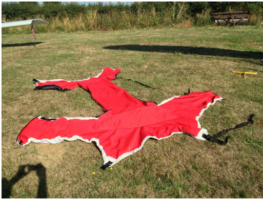
Porterfield Collegiate Canopy Cover