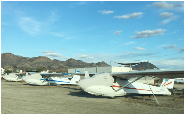
Schweizer SGS 2-33 Canopy/Nose Covers

the hottest of days. It is water, ice and snow repellent, yet breathable to allow moisture to escape from between the cover and the aircraft surface.