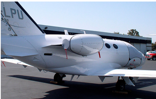
Citation Mustang Light Weight Engine Cover, Light Weight Windshield Cover, Pitot/AOA Cover

The Embraer Phenom 300 (EMB-505) Intake/Exhaust Plugs are custom fit for the intake and exhaust openings, made with heavy-duty vinyl material, and stuffed with a single block of sculpted urethane foam. Each plug has a zipper that allows the foam to be removed and dried if necessary. Engine plugs have 'remove before flight' streamers sewn onto the face of the plugs. Most plugs are imprinted with the aircraft registration number in black. Engine plugs may be inserted after flight when the engine is still warm. Engine Inlet Plugs are commonly referred to as Cowl Plugs, Intake Plugs, Cowl Blocks, Engine Blocks, and Engine Bungs.