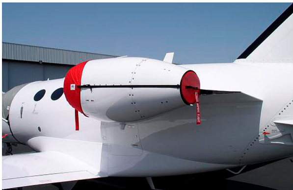
Cessna Mustang Intake/Exhaust Plug Set

stuffed with a single block of sculpted urethane foam. Each plug has a zipper that allows the foam to be removed and dried if necessary. Engine plugs have 'remove before flight' streamers sewn onto the face of the plugs. Most plugs are imprinted with the aircraft registration number in black for an extra charge. Storage bag NOT included. Engine plugs may be inserted after flight when the engine is still warm. Engine Inlet Plugs are commonly referred to as Cowl Plugs, Intake Plugs, Cowl Blocks, Engine Blocks, and Engine Bungs.