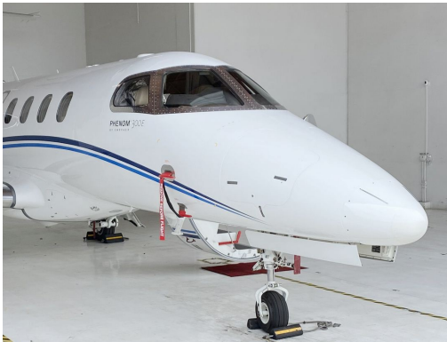
Embraer EMB-505 Pitot Cover Set

The Engine Inlet Plugs are custom fit for your Embraer Phenom 300 (EMB-505) intakes, made with heavy-duty vinyl material, and stuffed with a single block of sculpted urethane foam. Each plug has a zipper that allows the foam to be removed and dried if necessary. Engine plugs have 'remove before flight' streamers sewn onto the face of the plugs. Most plugs are imprinted with the aircraft registration number in black for an extra charge. Storage bag NOT included. Engine plugs may be inserted after flight when the engine is still warm. Engine Inlet Plugs are commonly referred to as Cowl Plugs, Intake Plugs, Cowl Blocks, Engine Blocks, and Engine Bungs.