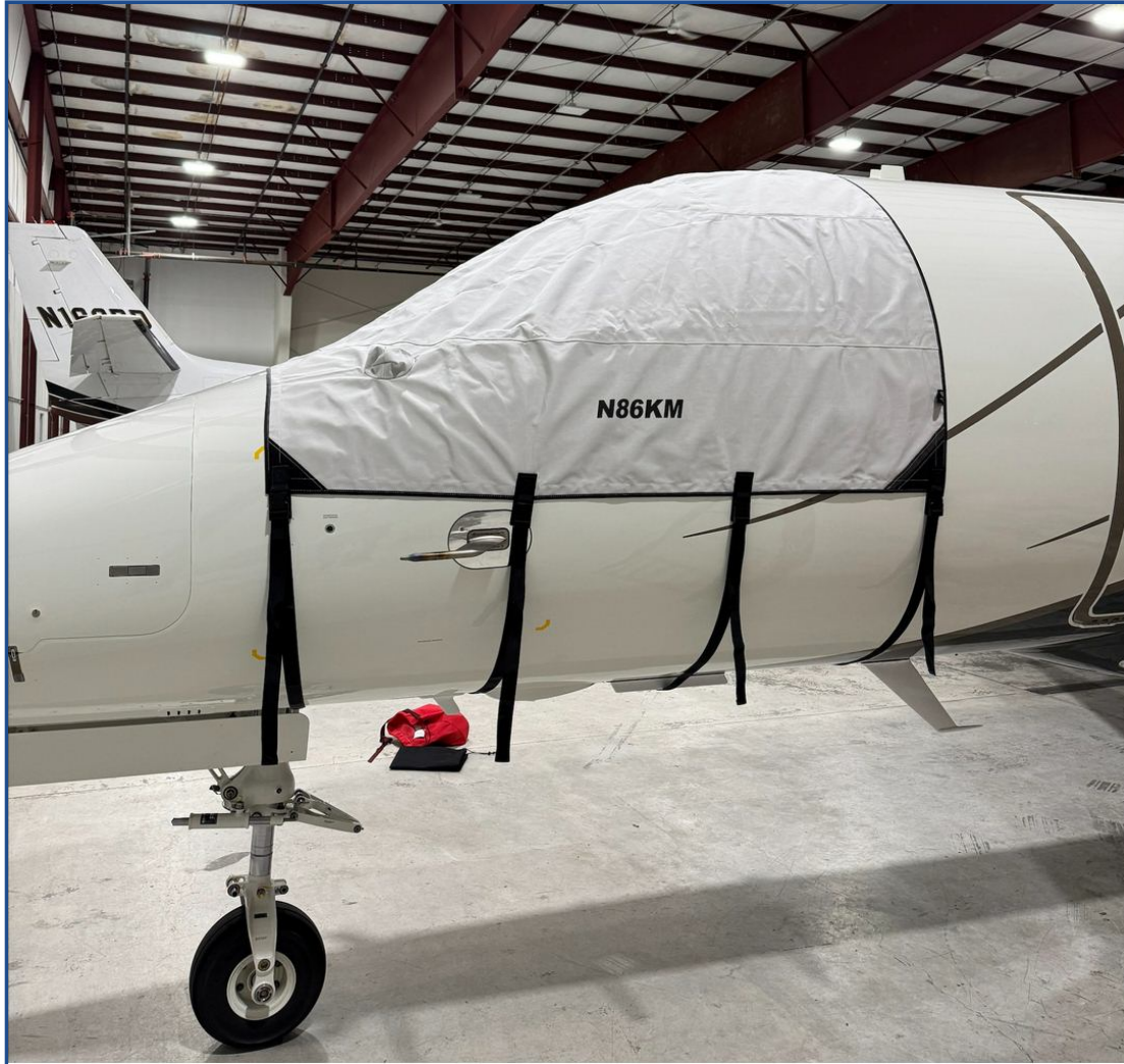
Phenom 300 Cockpit Cover