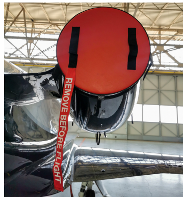
Embraer Phenom 300 ENGINE INLET COVERS & EXHAUST PLUGS (includes lower nacelle plug) (set of 6)