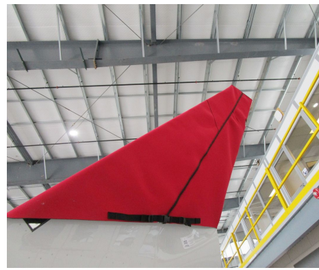
Bombardier Global Express Padded Winglet Covers