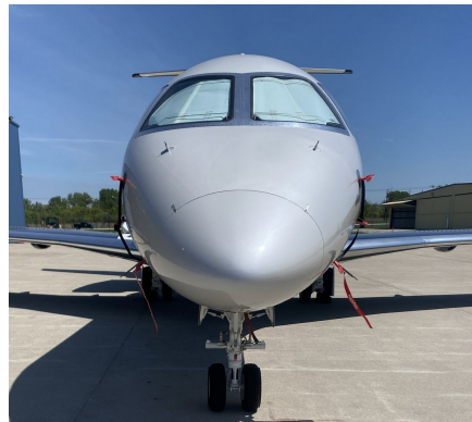
Embraer 505 Phenom 300 Cockpit HeatShields

Cockpit Heatshields are interior sunshades for the aircraft's cockpit. The product is a unique composite of closed-cell foam with a silver mylar finish. The semi-rigid design is stiff enough to stand inside the window framing. The set folds up flat and is easily stored in the included storage sleeve. Some designs may require velcro and suction cups. Our Heatshields for jets are offered white side out because some aircraft manufacturers have issued advisories against reflective window inserts due to potential heat damage. A Heatshield is an excellent short-term remedy for cockpit overheating, but an external fabric cover is more effective for long-term protection.