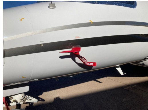
Embraer Phenom 300 (EMB-505) Heat Resistant Pitot Covers