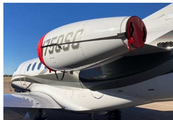
Hawker Beechcraft Premier Engine Covers, 3-Strap Style Embraer Phenom 300 (EMB-505) Engine Inlet Covers & Exhaust Plugs