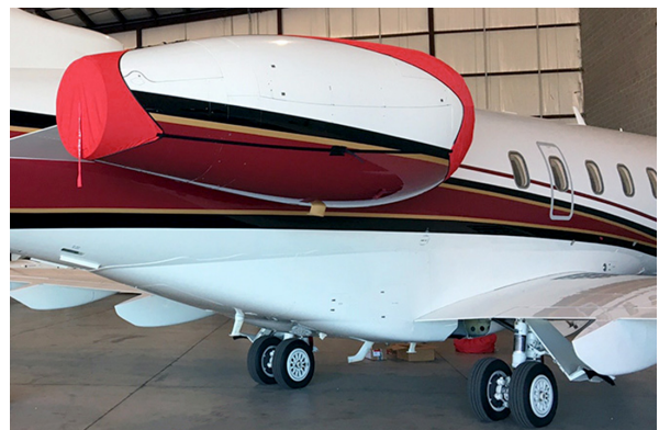
Intake/Exhaust Covers, 3-Strap Type. Successfully installed by two crew, one ladder.