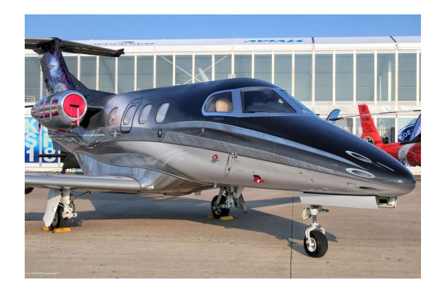
Phenom 100 Engine Inlet Plugs