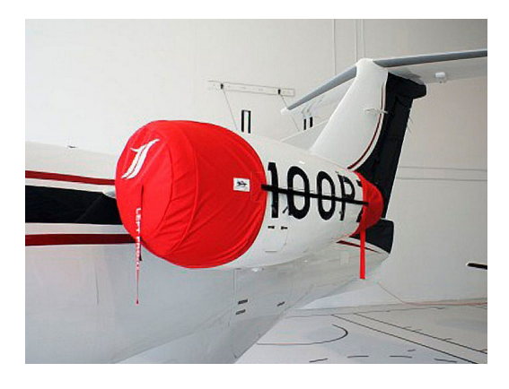
Phenom 100 Tri-fold style Engine Cover Set

Engine Inlet Plugs are commonly referred to as Cowl Plugs, Intake Plugs, Cowl Blocks, Engine Blocks, and Engine Bungs.