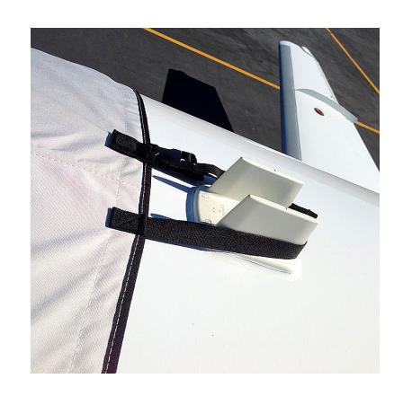
Phenom 100 EMB-500 Cockpit Cover (includes straps to hook around traffic antennae so the cover will not slip forward)