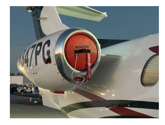
Embraer Phenom 100 Intake & Exhaust Plugs

The Engine Inlet Plugs are custom fit for your Embraer Phenom 100 (EMB-500) intakes, made with heavy-duty vinyl material, and stuffed with a single block of sculpted urethane foam. Each plug has a zipper that allows the foam to be removed and dried if necessary. Engine plugs have 'remove before flight' streamers sewn onto the face of the plugs. Most plugs are imprinted with the aircraft registration number in black for an extra charge. Storage bag NOT included. Engine plugs may be inserted after flight when the engine is still warm. Engine Inlet Plugs are commonly referred to as Cowl Plugs, Intake Plugs, Cowl Blocks, Engine Blocks, and Engine Bungs.