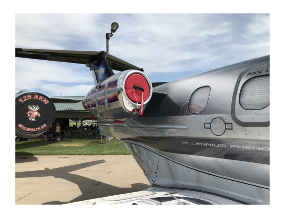
Embraer Phenom I Engine Inlet Plugs