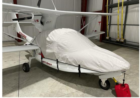
Scoda Super Petrel Canopy/Nose Cover