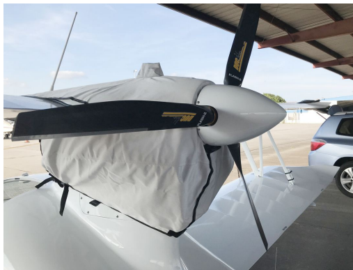
Scoda Aeronautica Super Petrel Engine Cover

Insulated Covers Material - A special composite material of solution-dyed polyester, 3M Thinsulate insulation, and soft nylon interior fabric. Our insulated covers are designed to complement an engine preheater and help retain heat in the engine compartment after shutdown. If you operate your aircraft in cold-weather, these covers will help prevent engine wear and tear.