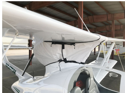
Scoda Aeronautica Super Petrel Engine Cover