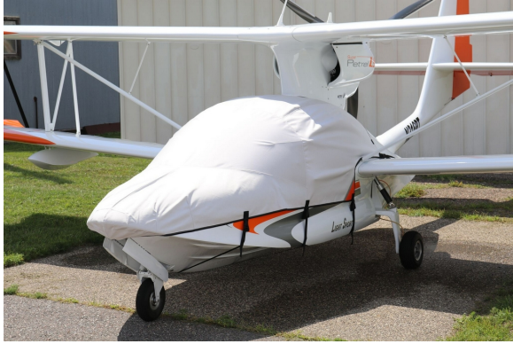
Scoda Aeronautica Super Petrel Canopy/Nose Cover

lightweight and more compact for easy stowage in the aircraft. The polyester material is water resistant, but only intended for occasional use outside. We also have an ultra lightweight material available for fitted hangar dust covers. For daily outdoor use, the non-travel Sunbrella Cover is the best choice.