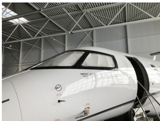
Pilatus PC-24 Cockpit HeatShields