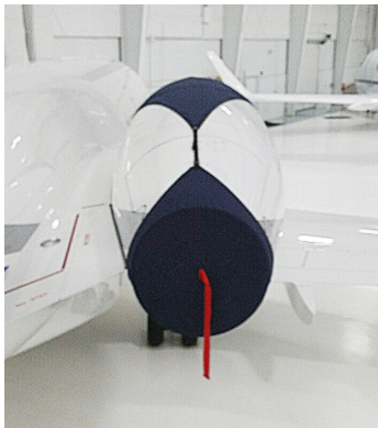
Challenger 300 Intake/Exhaust Cover Set, 3-strap type

The Pilatus PC-24 Intake/Exhaust Plugs are custom fit for the intake and exhaust openings, made with heavy-duty vinyl material, and stuffed with a single block of sculpted urethane foam. Each plug has a zipper that allows the foam to be removed and dried if necessary. Engine plugs have 'remove before flight' streamers sewn onto the face of the plugs. Most plugs are imprinted with the aircraft registration number in black. Engine plugs may be inserted after flight when the engine is still warm. Engine Inlet Plugs are commonly referred to as Cowl Plugs, Intake Plugs, Cowl Blocks, Engine Blocks, and Engine Bungs.