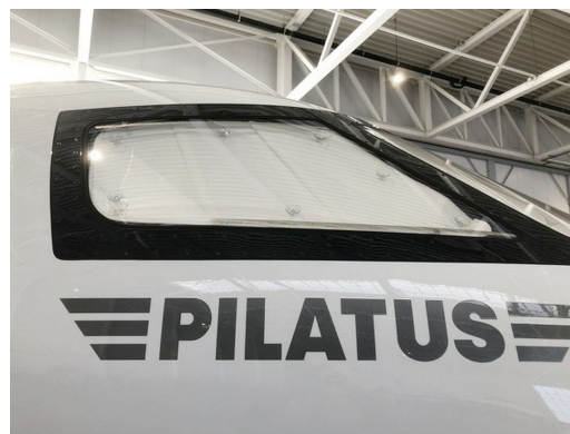
Pilatus PC-24 Cockpit HeatShields