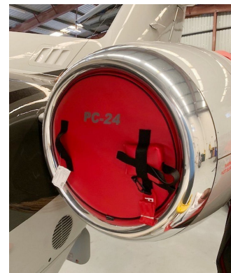
Pilatus PC-24 Engine Intake Plug