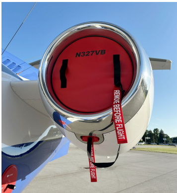
Pilatus PC-24 Engine Inlet Plugs & Exhaust Plugs, With Starter Inlet Plugs

The Engine Inlet Plugs are custom fit for your Pilatus PC-24 intakes, made with heavy-duty vinyl material, and stuffed with a single block of sculpted urethane foam. Each plug has a zipper that allows the foam to be removed and dried if necessary. Engine plugs have 'remove before flight' streamers sewn onto the face of the plugs. Most plugs are imprinted with the aircraft registration number in black for an extra charge. Storage bag NOT included. Engine plugs may be inserted after flight when the engine is still warm. Engine Inlet Plugs are commonly referred to as Cowl Plugs, Intake Plugs, Cowl Blocks, Engine Blocks, and Engine Bungs.