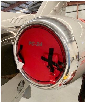
Pilatus PC-24 Engine Intake Plug