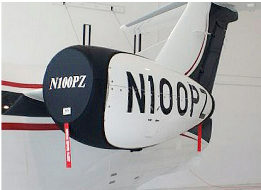
Phenom 100 "Bikini" Engine Covers