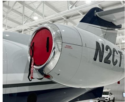
Pilatus PC-24 Engine Inlet Plugs