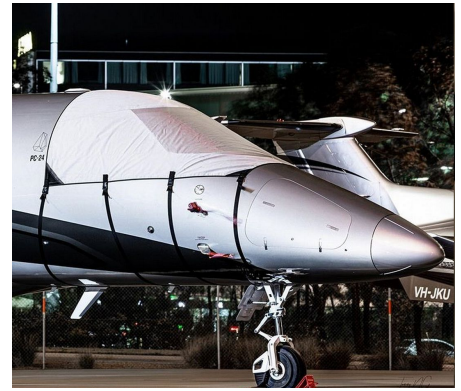
Pilatus PC-24 Cockpit Cover