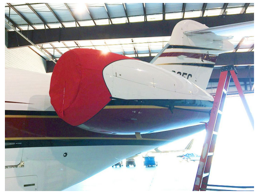
Canadair Challenger 300 Intake/Exhaust Covers, 3-Strap Type Canadair Challenger 300 Intake/Exhaust Covers, 3-Strap Type