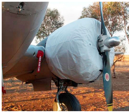
Beech D-18 Engine Covers, Center Section Oil Cooler Inlet Plugs, and Pitot Covers