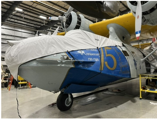
Consolidated Vultee PB5 Cockpit/Nose Cover