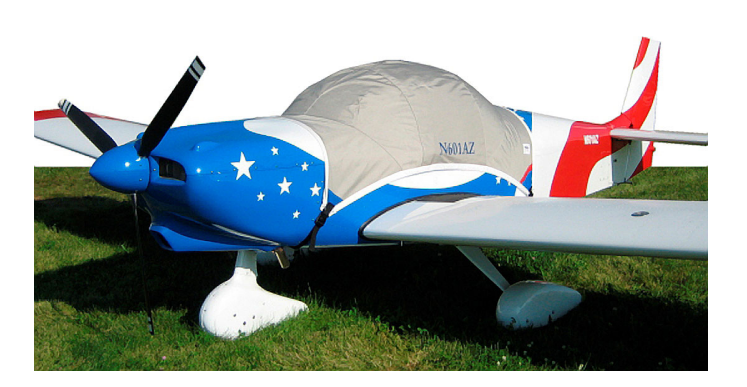
Zenith CH601 Canopy Cover