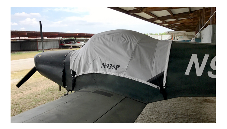
Pazmany PL2 Homebuilt Canopy Cover

This cover type is made from Silver Acrylic Sunbrella canvas and is 100% lined with a soft and smooth microfiber. Bruce's Custom Covers developed this material combination especially for aircraft protection. The outer material is medium weight and treated for water resistance, UV resistance and anti-static buildup. The inner lining is a very soft and smooth microfiber to prevent scratching. The material is very reflective, and tests show that the cabin interior temperature can be reduced to near-ambient temperature on the hottest of days. It is water, ice and snow repellent, yet breathable to allow moisture to escape from between the cover and the aircraft surface.