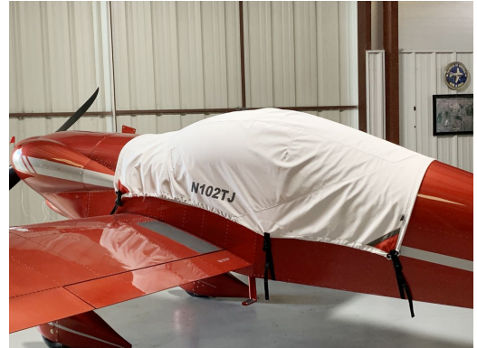
SPA Sport Panther Canopy Cover