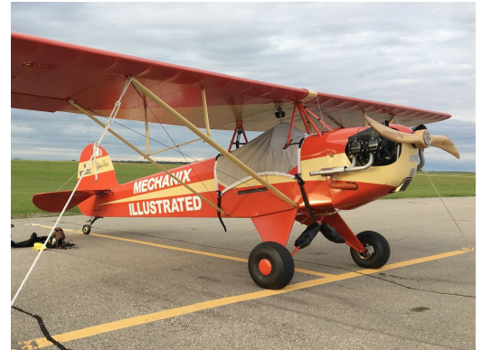
Corben Baby Ace Cockpit Cover