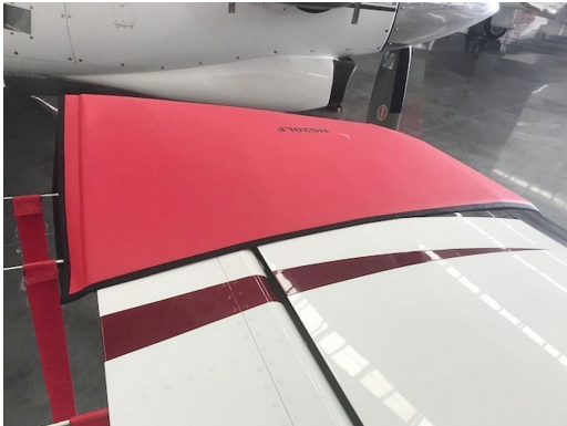
Piper Meridian Wingtip Pads, M600 Models

Designed to prevent damage to the aircraft extremities in crowded hangars, these products are made of bright red Naugahyde and thickly padded with a sandwich of closed cell foam.