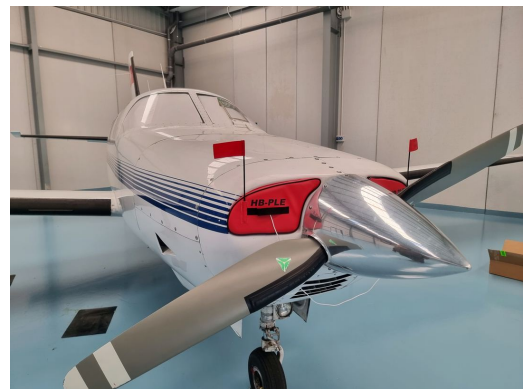
Piper PA-46 Malibu Engine Inlet Plugs