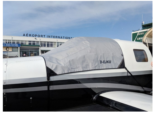
Piper PA46-350P Malibu Mirage Travel Cockpit Cover