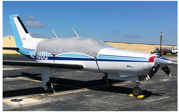
Piper PA-46 Malibu Travel Cover