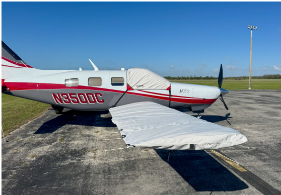
Piper PA 46-350P Cockpit & Wing Covers

WINTER USE MATERIAL - Made with Solution-Dyed Polyester fabric, this option is intended for seasonal use to aid in deicing, rain mitigation, or for occasional travel. The material is lighter and more compact, but more susceptible to UV damage and may have a shorter useful life if used continuously outside than the all-year use material.