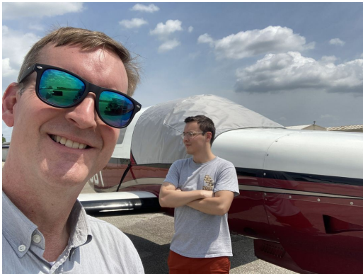
Piper Malibu/Mirage Cockpit Cover