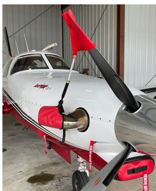
Piper Malibu JetProp Plugs, Prop Tie, Exhaust Covers

This cover type is made from Silver Acrylic Sunbrella canvas and is 100% lined with a soft and smooth microfiber. Bruce's Custom Covers developed this material combination especially for aircraft protection. The outer material is medium weight and treated for water resistance, UV resistance and anti-static buildup. The inner lining is a very soft and smooth microfiber to prevent scratching. The material is very reflective, and tests show that the cabin interior temperature can be reduced to near-ambient temperature on the hottest of days. It is water, ice and snow repellent, yet breathable to allow moisture to escape from between the cover and the aircraft surface.