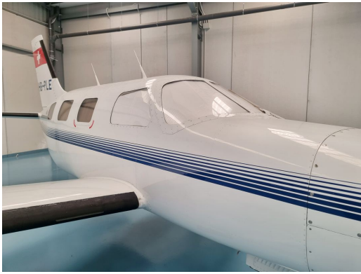
Piper PA-46 Malibu Cockpit Heatshields