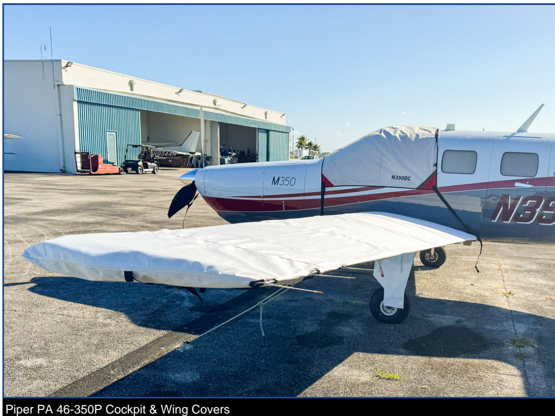
Piper PA 46-350P Cockpit &amp; Wing Covers