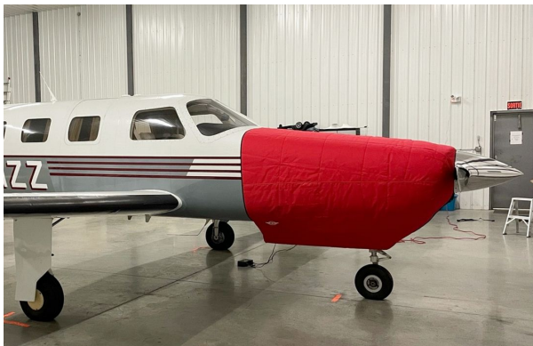
Malibu PA-46-310P Insulated Engine Cover

This cover type is made from Silver Acrylic Sunbrella canvas and is 100% lined with a soft and smooth microfiber. Bruce's Custom Covers developed this material combination especially for aircraft protection. The outer material is medium weight and treated for water resistance, UV resistance and anti-static buildup. The inner lining is a very soft and smooth microfiber to prevent scratching. The material is very reflective, and tests show that the cabin interior temperature can be reduced to near-ambient temperature on the hottest of days. It is water, ice and snow repellent, yet breathable to allow moisture to escape from between the cover and the aircraft surface.