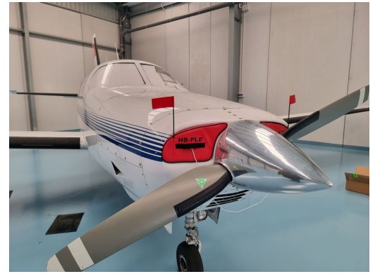
Piper PA-46 Malibu Engine Inlet Plugs