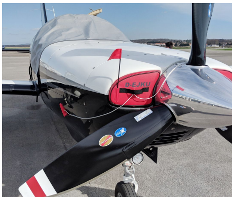
Piper PA46-350P Malibu Mirage Engine Inlet Plugs

Engine Inlet Plugs are custom fit for your Piper PA-46 Malibu intakes, made with heavy-duty vinyl material, and stuffed with a single block of sculpted urethane foam. Each plug has a zipper that allows the foam to be removed and dried if necessary. Engine plugs have warning flags that are visible from the cockpit or 'remove before flight' streamers sewn onto the face of the plugs. Most plugs are imprinted with the aircraft registration number in black for an extra charge. Storage bag NOT included. Engine plugs may be inserted after flight when the engine is still warm. Engine Inlet Plugs are commonly referred to as Cowl Plugs, Intake Plugs, Cowl Blocks, Engine Blocks, and Engine Bungs.