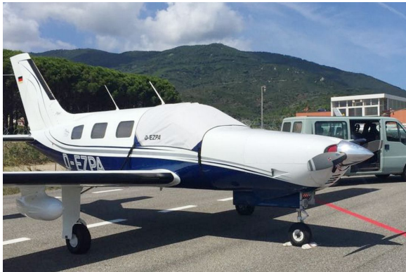
Piper Mirage PA-46-350P Cockpit Cover

This cover type is made from Silver Acrylic Sunbrella canvas and is 100% lined with a soft and smooth microfiber. Bruce's Custom Covers developed this material combination especially for aircraft protection. The outer material is medium weight and treated for water resistance, UV resistance and anti-static buildup. The inner lining is a very soft and smooth microfiber to prevent scratching. The material is very reflective, and tests show that the cabin interior temperature can be reduced to near-ambient temperature on the hottest of days. It is water, ice and snow repellent, yet breathable to allow moisture to escape from between the cover and the aircraft surface.