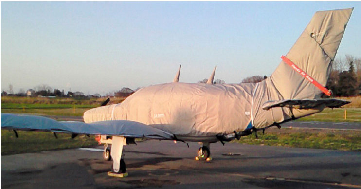
Piper PA-46 Malibu Complete Cover Set