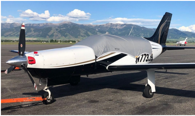
Piper PA46-350P Travel Canopy Cover, Engine Plugs