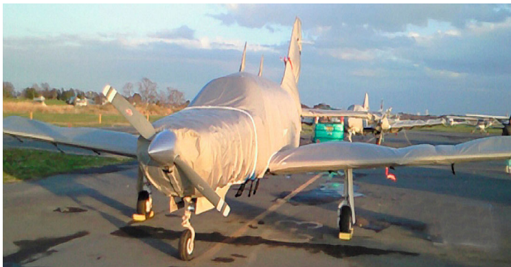
Piper PA-46 Malibu Complete Cover Set