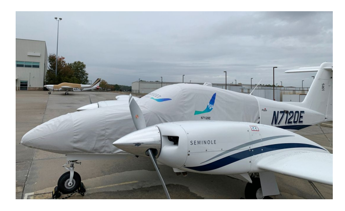
Piper PA-44 Seminole Canopy/Nose Cover

Piper PA-44 Seminole Canopy/Nose Cover with custom artwork