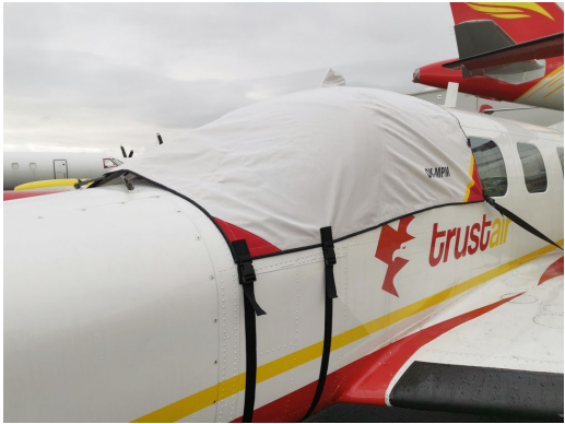
Piper PA-42 Cheyenne III Cockpit Cover