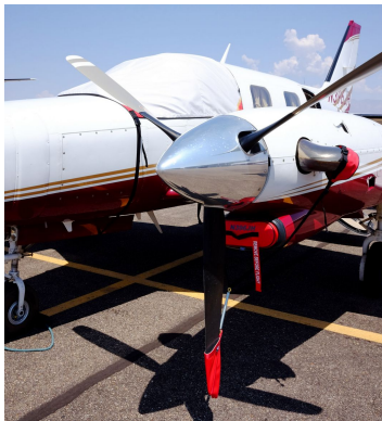
Piper Cheyenne Cockpit Cover, Engine Plugs, Prop Tie/Exhaust Covers

Travel Covers are made with Silver Solution-Dyed Polyester fabric and only lined over the windshield to save weight. The material is lightweight and more compact for easy stowage in the aircraft. The polyester material is water resistant, but only intended for occasional use outside. We also have an ultra lightweight material available for fitted hangar dust covers. For daily outdoor use, the non-travel Sunbrella Cover is the best choice.