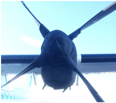
ATR-72-202 Insulated Engine & Prop Hub Covers

This cover type is made from Silver Acrylic Sunbrella canvas and is 100% lined with a soft and smooth microfiber. Bruce's Custom Covers developed this material combination especially for aircraft protection. The outer material is medium weight and treated for water resistance, UV resistance and anti-static buildup. The inner lining is a very soft and smooth microfiber to prevent scratching. The material is very reflective, and tests show that the cabin interior temperature can be reduced to near-ambient temperature on the hottest of days. It is water, ice and snow repellent, yet breathable to allow moisture to escape from between the cover and the aircraft surface.