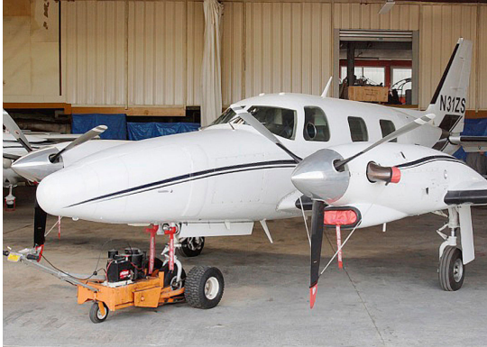
Piper Cheyenne IIXL Prop Tie/Exhaust Covers, Intake Plugs

Engine Inlet Plugs are custom fit for your Piper PA-42 Cheyenne III intakes, made with heavy-duty vinyl material, and stuffed with a single block of sculpted urethane foam. Each plug has a zipper that allows the foam to be removed and dried if necessary. Engine plugs have warning flags that are visible from the cockpit or 'remove before flight' streamers sewn onto the face of the plugs. Most plugs are imprinted with the aircraft registration number in black for an extra charge. Storage bag NOT included. Engine plugs may be inserted after flight when the engine is still warm. Engine Inlet Plugs are commonly referred to as Cowl Plugs, Intake Plugs, Cowl Blocks, Engine Blocks, and Engine Bungs.