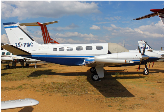
Cessna 441 Conquest II Cockpit Cover

This cover type is made from Silver Acrylic Sunbrella canvas and is 100% lined with a soft and smooth microfiber. Bruce's Custom Covers developed this material combination especially for aircraft protection. The outer material is medium weight and treated for water resistance, UV resistance and anti-static buildup. The inner lining is a very soft and smooth microfiber to prevent scratching. The material is very reflective, and tests show that the cabin interior temperature can be reduced to near-ambient temperature on the hottest of days. It is water, ice and snow repellent, yet breathable to allow moisture to escape from between the cover and the aircraft surface.