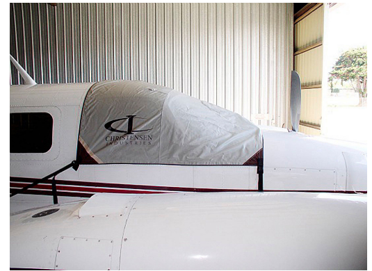
Piper Cheyenne Cockpit Cover