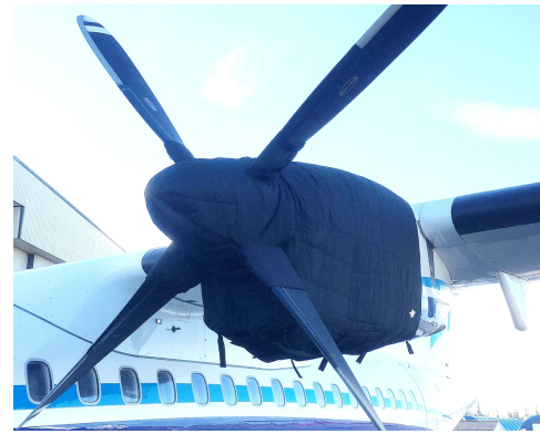
ATR-72-202 Insulated Engine & Prop Hub Covers