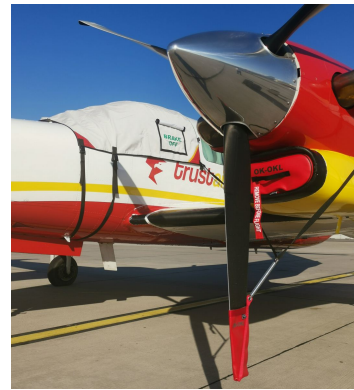
Piper PA-42 Cheyenne III Engine Plugs, Prop Ties, Cockpit Cover