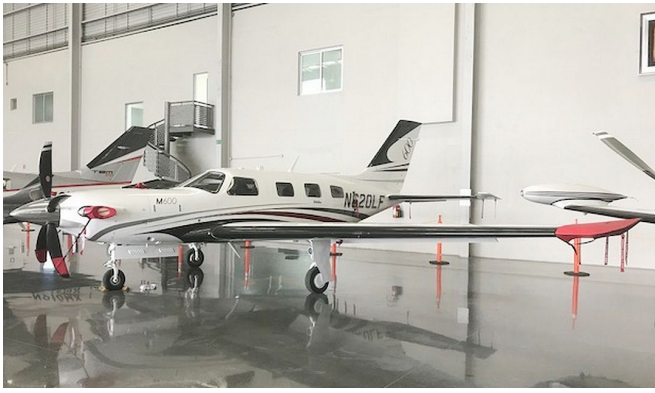
Piper Meridian Wingtip Pads, M600 Models