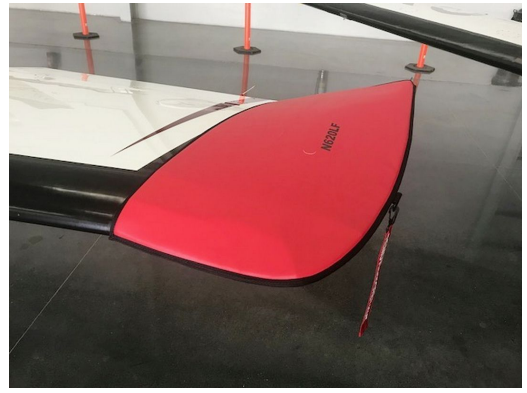
Piper Meridian Wingtip Pads, M600 Models