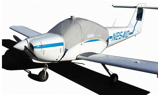
Piper Tomahawk Canopy Cover

Travel Covers are made with Silver Solution-Dyed Polyester fabric and only lined over the windshield to save weight. The material is lightweight and more compact for easy stowage in the aircraft. The polyester material is water resistant, but only intended for occasional use outside. We also have an ultra lightweight material available for fitted hangar dust covers. For daily outdoor use, the non-travel Sunbrella Cover is the best choice.