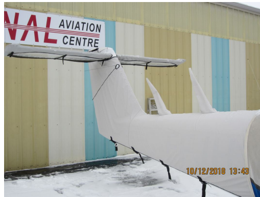
Piper PA-38 Tomahawk Empennage Cover (Tailboom, Vertical & Horiz Stabilizers) Set (W/Horiz. Stab. Cover), Winter Use

WINTER USE MATERIAL - Made with Solution-Dyed Polyester fabric, this option is intended for seasonal use to aid in deicing, rain mitigation, or for occasional travel. The material is lighter and more compact, but more susceptible to UV damage and may have a shorter useful life if used continuously outside than the all-year use material.