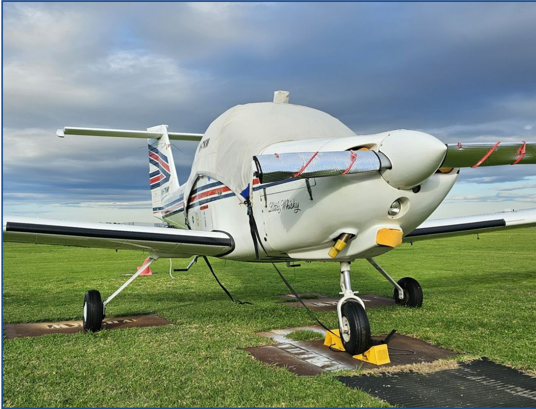
Piper PA-38 Tomahawk Canopy Cover