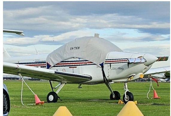
Piper PA-38 Tomahawk Canopy Cover