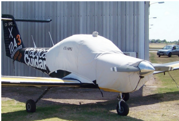
Piper Tomahawk Extended Canopy/Engine Cover

This cover type is made from Silver Acrylic Sunbrella canvas and is 100% lined with a soft and smooth microfiber. Bruce's Custom Covers developed this material combination especially for aircraft protection. The outer material is medium weight and treated for water resistance, UV resistance and anti-static buildup. The inner lining is a very soft and smooth microfiber to prevent scratching. The material is very reflective, and tests show that the cabin interior temperature can be reduced to near-ambient temperature on the hottest of days. It is water, ice and snow repellent, yet breathable to allow moisture to escape from between the cover and the aircraft surface.