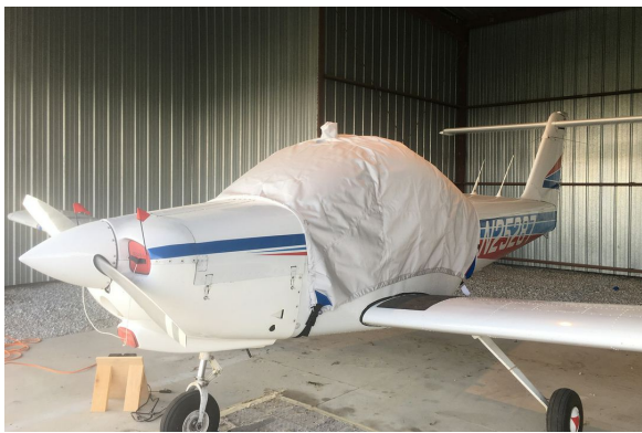
Piper PA38-112 Extended Canopy Cover, covering door.