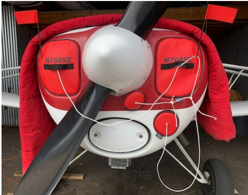
Piper PA-25 Pawnee Engine Plugs

Engine Inlet Plugs are custom fit for your Piper Pawnee PA-25 intakes, made with heavy-duty vinyl material, and stuffed with a single block of sculpted urethane foam. Each plug has a zipper that allows the foam to be removed and dried if necessary. Engine plugs have warning flags that are visible from the cockpit or 'remove before flight' streamers sewn onto the face of the plugs. Most plugs are imprinted with the aircraft registration number in black for an extra charge. Storage bag NOT included. Engine plugs may be inserted after flight when the engine is still warm. Engine Inlet Plugs are commonly referred to as Cowl Plugs, Intake Plugs, Cowl Blocks, Engine Blocks, and Engine Bungs.