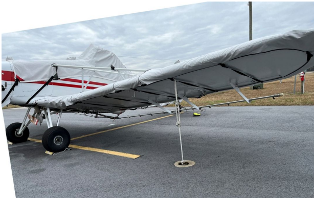
Piper PA-25 Pawnee Cover Set

WINTER USE MATERIAL - Made with Solution-Dyed Polyester fabric, this option is intended for seasonal use to aid in deicing, rain mitigation, or for occasional travel. The material is lighter and more compact, but more susceptible to UV damage and may have a shorter useful life if used continuously outside than the all-year use material.