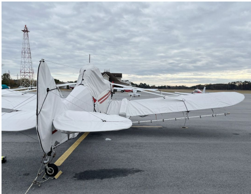
Piper PA-25 Pawnee Cover Set