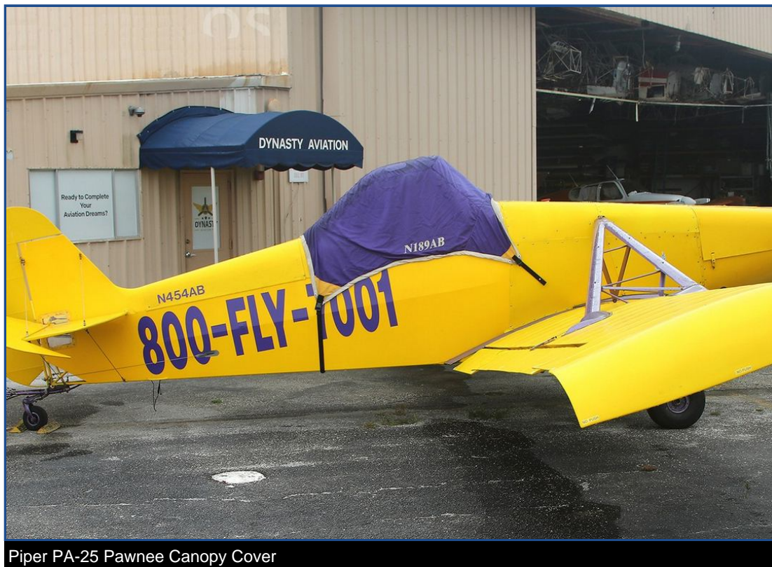
Piper PA-25 Pawnee Canopy Cover