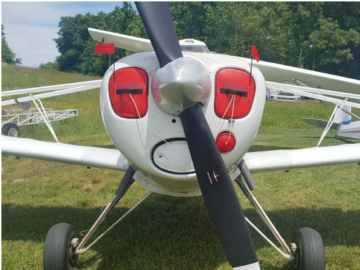
Piper Pa-25-235 Engine Inlet Plugs