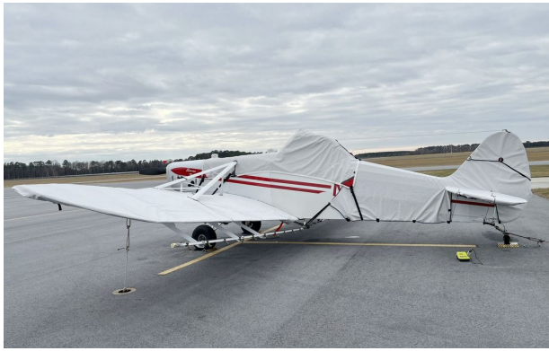
Piper PA-25 Pawnee Cover Set