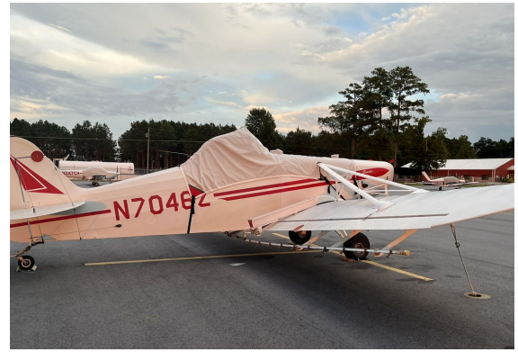
Piper PA-25 Pawnee Canopy/Hopper Cover