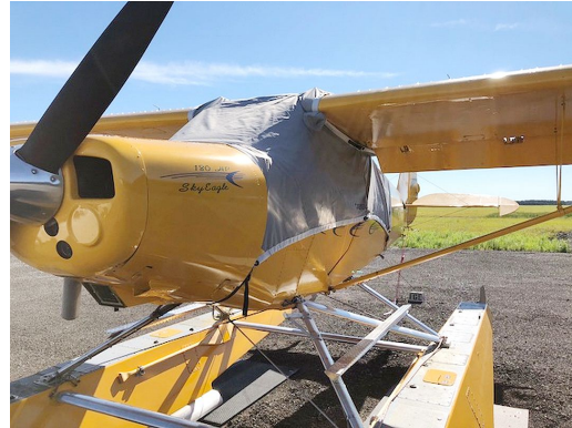
Piper PA-12 Super Cruiser Over-Top Canopy Cover Sportsman 2+2 Wag Aero Light Weight Over the Top Travel Canopy Cover