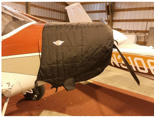
Piper PA-12 Insulated Engine Cover