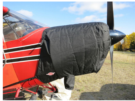
Piper PA-12 Insulated Engine Cover