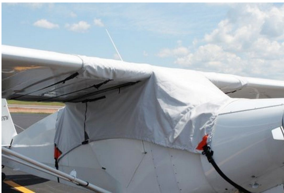
Piper PA-12 Super Cruiser Canopy Cover (Over-The-Top Style), extended to cover gas caps.

This cover type is made from Silver Acrylic Sunbrella canvas and is 100% lined with a soft and smooth microfiber. Bruce's Custom Covers developed this material combination especially for aircraft protection. The outer material is medium weight and treated for water resistance, UV resistance and anti-static buildup. The inner lining is a very soft and smooth microfiber to prevent scratching. The material is very reflective, and tests show that the cabin interior temperature can be reduced to near-ambient temperature on the hottest of days. It is water, ice and snow repellent, yet breathable to allow moisture to escape from between the cover and the aircraft surface.