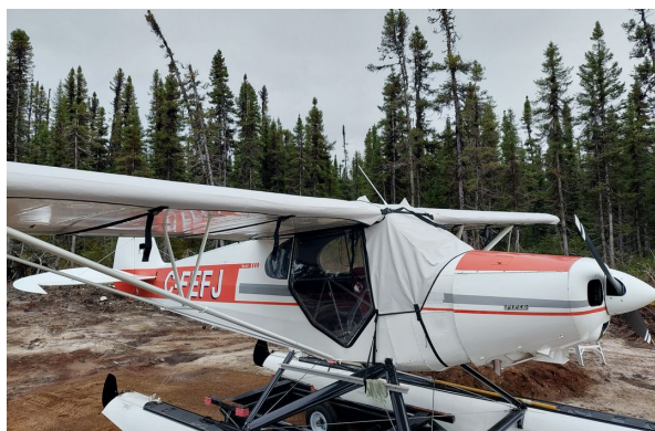
Piper PA-12 Windshield/Skylight & Wing Covers