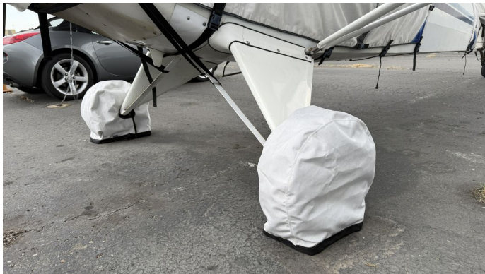
Piper PA-12: Super Cruiser, J5 Cub Tire Covers (No Wheelpant Faring) (Specify Tire Size)