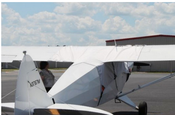
Piper PA-12 Super Cruiser Canopy Cover (Over-The-Top Style), extended to cover gas caps.

This cover type is made from Silver Acrylic Sunbrella canvas and is 100% lined with a soft and smooth microfiber. Bruce's Custom Covers developed this material combination especially for aircraft protection. The outer material is medium weight and treated for water resistance, UV resistance and anti-static buildup. The inner lining is a very soft and smooth microfiber to prevent scratching. The material is very reflective, and tests show that the cabin interior temperature can be reduced to near-ambient temperature on the hottest of days. It is water, ice and snow repellent, yet breathable to allow moisture to escape from between the cover and the aircraft surface.