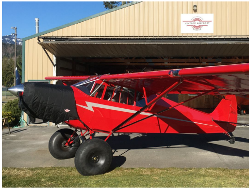
Piper PA-12 Insulated Engine Cover