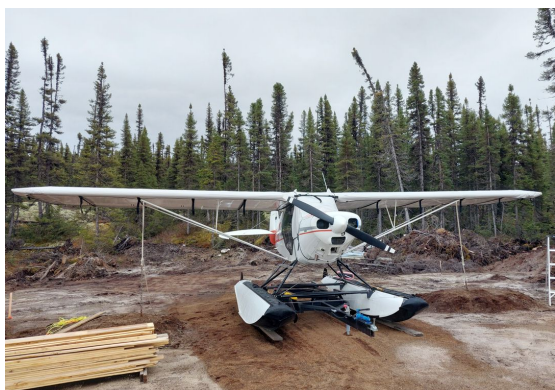
Piper PA-12 Windshield/Skylight & Wing Covers