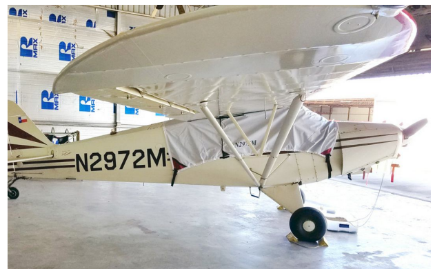
Piper PA-12 Wrap-Around Canopy Cover