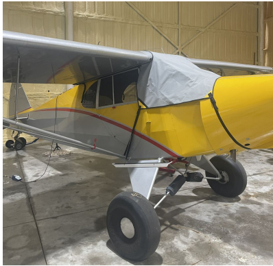
Piper PA-12: Super Cruiser Light Weight Travel Windshield/Skylight Cover