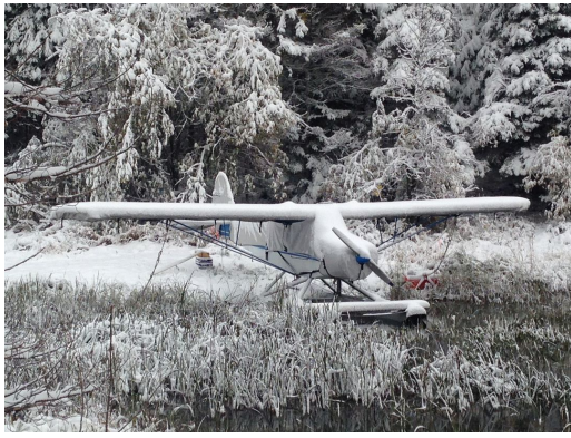
Piper PA-11 Cover Set