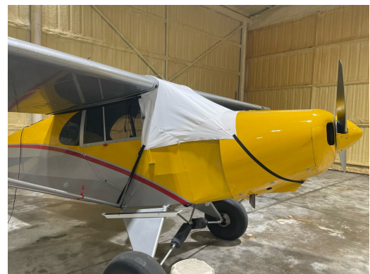
Piper J5A Windshield/Skylight Cover, test fit