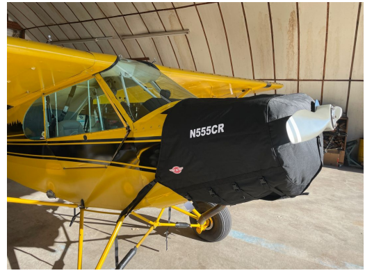
Piper PA-11 Replica Insulated Engine Cover