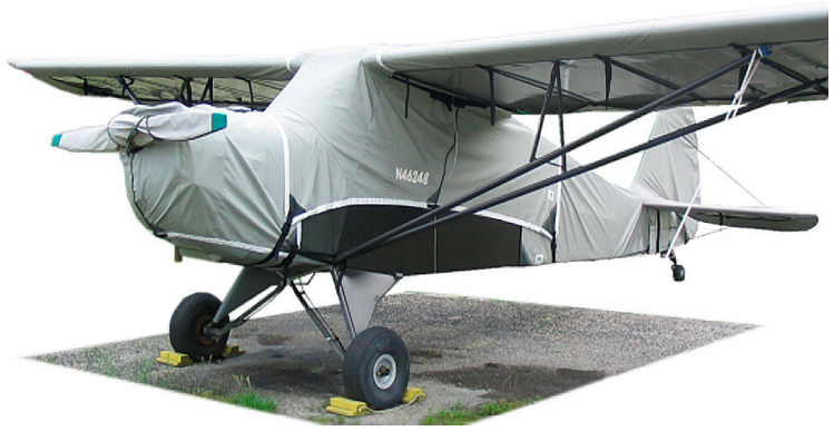
Piper PA-11 Replica Insulated Engine Cover Prop Cover, Engine Cover, Canopy Cover, Wing Covers and Empennage Cover