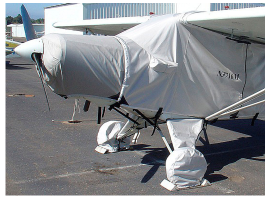
Piper PA-12 Landing Gear Covers