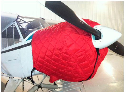
ENGINE PLUGS PREVENT BIRD NEST FOD. Piper Saratoga Engine Cowling Bird's Nest Piper Super Cub Insulated Engine Cover