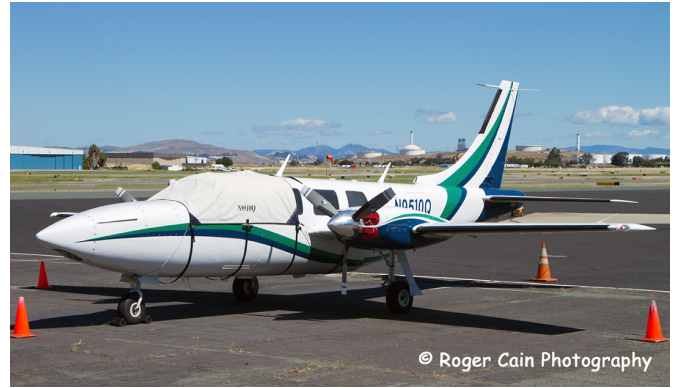
Piper Aerostar Cockpit Cover and Engine Inlet Plugs