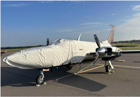
Piper PA-601 Aerostar Fuselage Cover (back to Horiz Stab)

The Piper PA-601 Aerostar Nose Cover is designed to cover the section of the fuselage forward of the windshield to the tip of the nose. It is secured with belly straps. This cover type is made from Silver Acrylic Sunbrella canvas and is 100% lined with a soft and smooth microfiber. Bruce's Custom Covers developed this material combination especially for aircraft protection. The outer material is medium weight and treated for water resistance, UV resistance and anti-static buildup. The inner lining is a very soft and smooth microfiber to prevent scratching. The material is very reflective, and tests show that the cabin interior temperature can be reduced to near-ambient temperature on the hottest of days. It is water, ice and snow repellent, yet breathable to allow moisture to escape from between the cover and the aircraft surface.