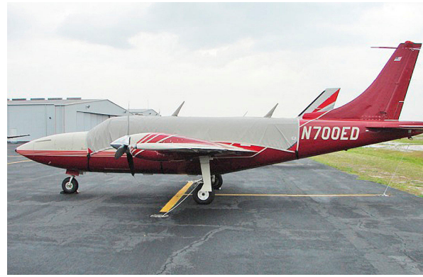
Piper Aerostar Canopy Cover, extended over baggage door