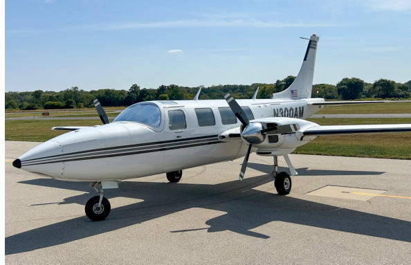
Aerostar 601P Windshield Heatshield

Windshield Heatshields are interior sunshades for an aircraft's front windshield. The product is a unique composite of closed-cell foam with a silver mylar finish. The semi-rigid design is stiff enough to stand along the inside of the windshield using sun visors or window framing. It folds up flat and easily stores in the included storage sleeve. Some designs may require velcro and suction cups or split right and left sides. A Heatshield is an excellent short-term remedy for cockpit overheating. An external fabric cover is far more effective and practical for long-term protection.