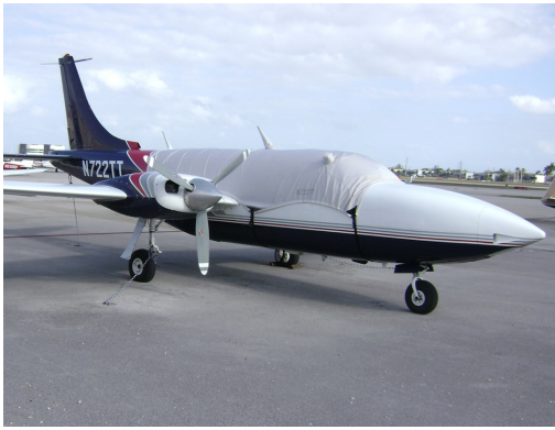
Aerostar Canopy Cover