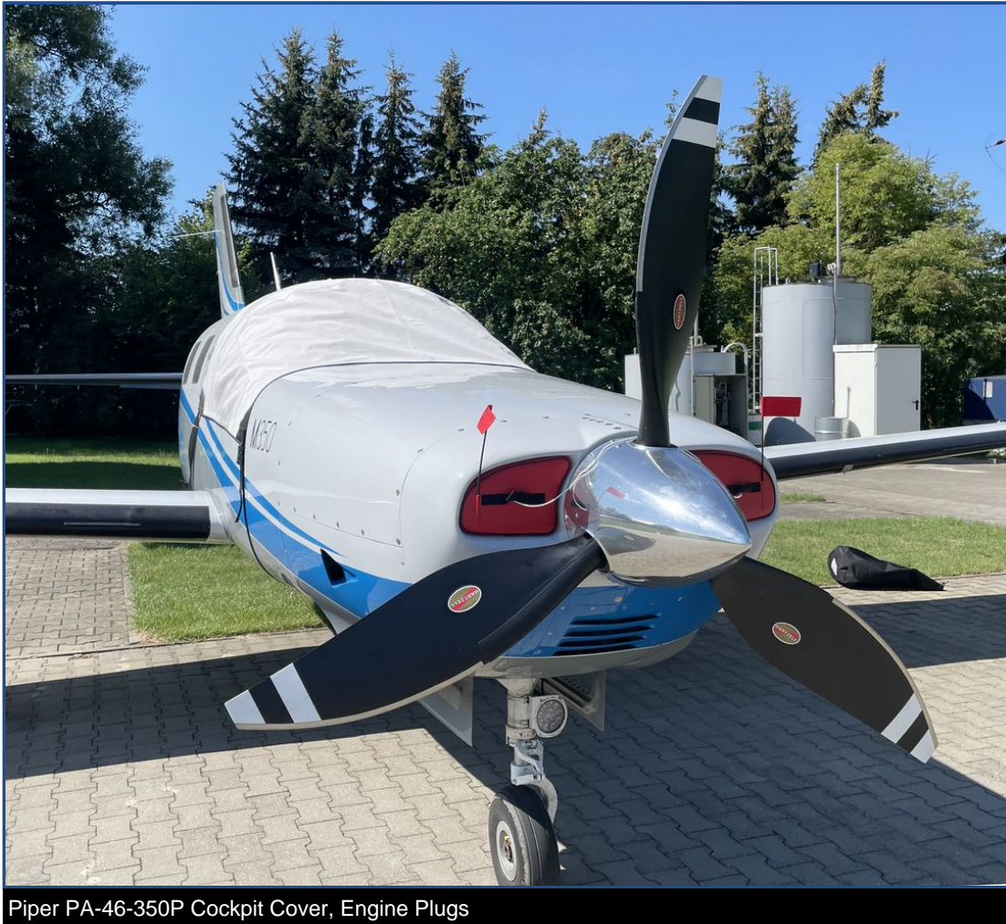
Piper PA-46-350P Cockpit Cover, Engine Plugs