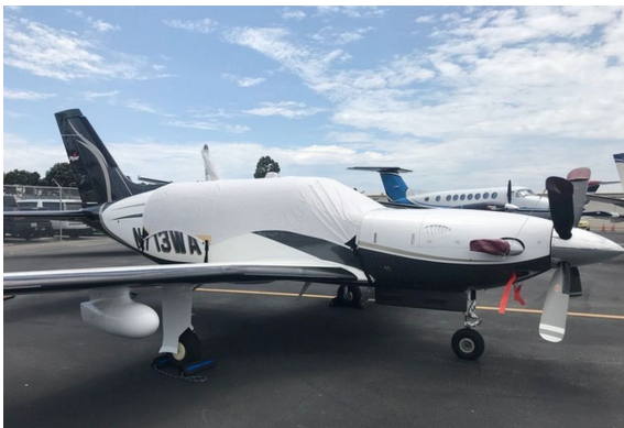
Piper Meridian Canopy Cover

This cover type is made from Silver Acrylic Sunbrella canvas and is 100% lined with a soft and smooth microfiber. Bruce's Custom Covers developed this material combination especially for aircraft protection. The outer material is medium weight and treated for water resistance, UV resistance and anti-static buildup. The inner lining is a very soft and smooth microfiber to prevent scratching. The material is very reflective, and tests show that the cabin interior temperature can be reduced to near-ambient temperature on the hottest of days. It is water, ice and snow repellent, yet breathable to allow moisture to escape from between the cover and the aircraft surface.