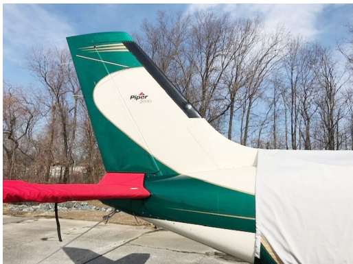
Piper Malibu/Mirage Horizontal Stabilizer/Tailcone Cover

shorter useful life if used continuously outside than the all-year use material.