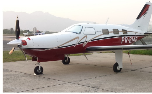
Piper Malibu/Mirage Engine Plugs, Cockpit HeatShields