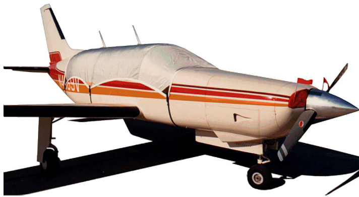
Malibu/Mirage/Meridian Standard Canopy Cover