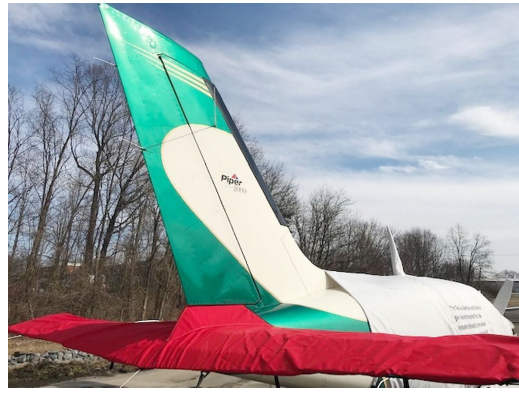
Piper Malibu/Mirage Horizontal Stabilizer/Tailcone Cover