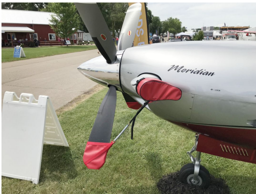
Piper Meridian Prop Tie/Exhaust Covers

This cover type is made from Silver Acrylic Sunbrella canvas and is 100% lined with a soft and smooth microfiber. Bruce's Custom Covers developed this material combination especially for aircraft protection. The outer material is medium weight and treated for water resistance, UV resistance and anti-static buildup. The inner lining is a very soft and smooth microfiber to prevent scratching. The material is very reflective, and tests show that the cabin interior temperature can be reduced to near-ambient temperature on the hottest of days. It is water, ice and snow repellent, yet breathable to allow moisture to escape from between the cover and the aircraft surface.