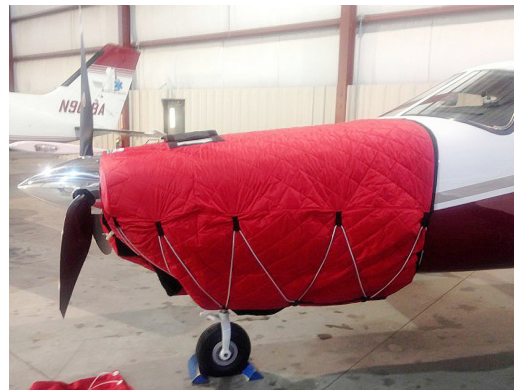
Piper PA-46 Insulated Engine Cover, fully enclosed with oil door flap