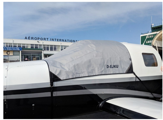
Piper PA46-350P Malibu Mirage Travel Cockpit Cover