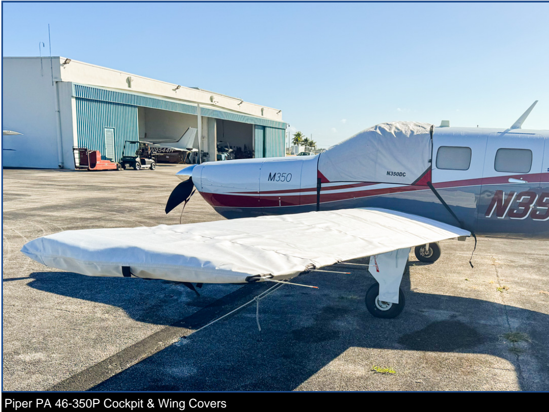
Piper PA 46-350P Cockpit &amp; Wing Covers