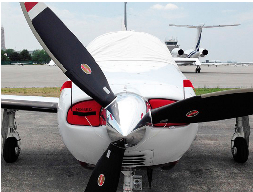
Piper Mirage Engine Plugs

Engine Inlet Plugs are custom fit for your Piper PA-46-500TP, 600TP Meridian, M500, M600, M700 intakes, made with heavy-duty vinyl material, and stuffed with a single block of sculpted urethane foam. Each plug has a zipper that allows the foam to be removed and dried if necessary. Engine plugs have warning flags that are visible from the cockpit or 'remove before flight' streamers sewn onto the face of the plugs. Most plugs are imprinted with the aircraft registration number in black for an extra charge. Storage bag NOT included. Engine plugs may be inserted after flight when the engine is still warm. Engine Inlet Plugs are commonly referred to as Cowl Plugs, Intake Plugs, Cowl Blocks, Engine Blocks, and Engine Bungs.