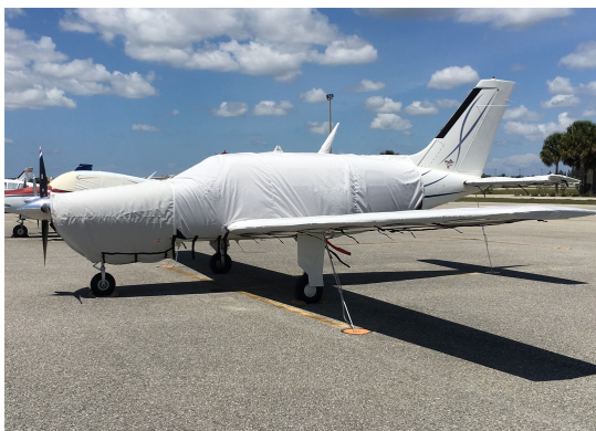
Piper Malibu Extended Canopy Cover, Engine, Wing & Horiz. Stab. Covers

This cover type is made from Silver Acrylic Sunbrella canvas and is 100% lined with a soft and smooth microfiber. Bruce's Custom Covers developed this material combination especially for aircraft protection. The outer material is medium weight and treated for water resistance, UV resistance and anti-static buildup. The inner lining is a very soft and smooth microfiber to prevent scratching. The material is very reflective, and tests show that the cabin interior temperature can be reduced to near-ambient temperature on the hottest of days. It is water, ice and snow repellent, yet breathable to allow moisture to escape from between the cover and the aircraft surface.