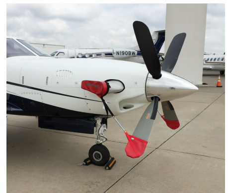
Piper Meridian Prop Tie/Exhaust Cover Set