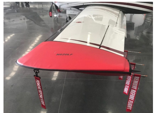
Piper Meridian Wingtip Pads, M600 Models