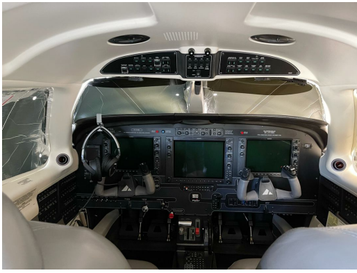
Piper PA46-500TP Cockpit Heatshields