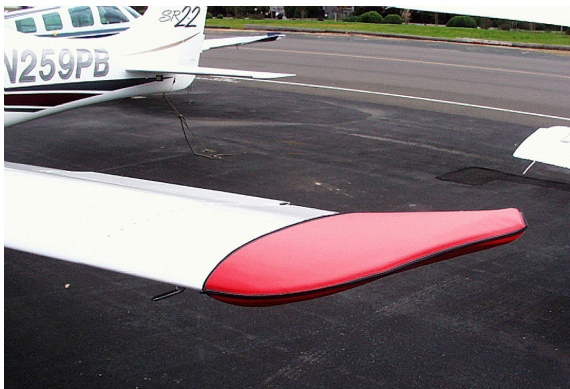
Cirrus SR-22 Wingtip Pad (also available for the Horiz. Stab.)

Designed to prevent damage to the aircraft extremities in crowded hangars, these products are made of bright red Naugahyde and thickly padded with a sandwich of closed cell foam.