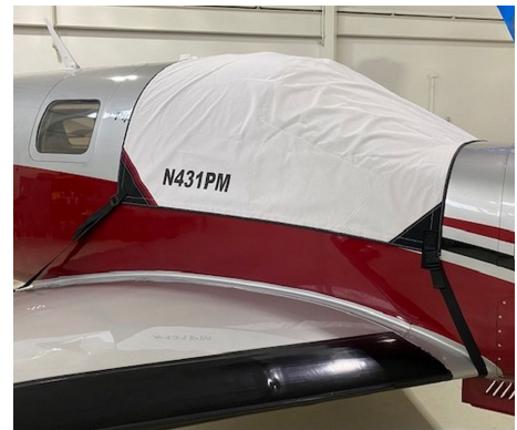
Piper Meridian Cockpit Cover