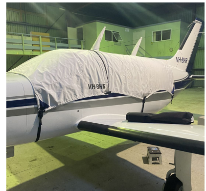
Piper PA-46 Malibu Canopy Cover