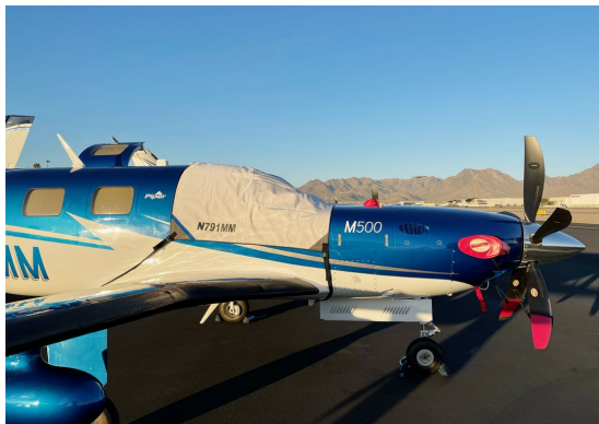
Piper PA46-500TP Cockpit Cover

This cover type is made from Silver Acrylic Sunbrella canvas and is 100% lined with a soft and smooth microfiber. Bruce's Custom Covers developed this material combination especially for aircraft protection. The outer material is medium weight and treated for water resistance, UV resistance and anti-static buildup. The inner lining is a very soft and smooth microfiber to prevent scratching. The material is very reflective, and tests show that the cabin interior temperature can be reduced to near-ambient temperature on the hottest of days. It is water, ice and snow repellent, yet breathable to allow moisture to escape from between the cover and the aircraft surface.