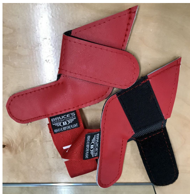
Piper PA-46-600TP M600 Pitot Covers, Heat Resistant Type, M600 Model Only

Engine Inlet Plugs are custom fit for your Piper PA-46-500TP, 600TP Meridian, M500, M600, M700 intakes, made with heavy-duty vinyl material, and stuffed with a single block of sculpted urethane foam. Each plug has a zipper that allows the foam to be removed and dried if necessary. Engine plugs have warning flags that are visible from the cockpit or 'remove before flight' streamers sewn onto the face of the plugs. Most plugs are imprinted with the aircraft registration number in black for an extra charge. Storage bag NOT included. Engine plugs may be inserted after flight when the engine is still warm. Engine Inlet Plugs are commonly referred to as Cowl Plugs, Intake Plugs, Cowl Blocks, Engine Blocks, and Engine Bungs.