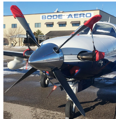
Piper PA46TP-500 Meridian Prop Tie/Exhaust Covers, Engine Plugs