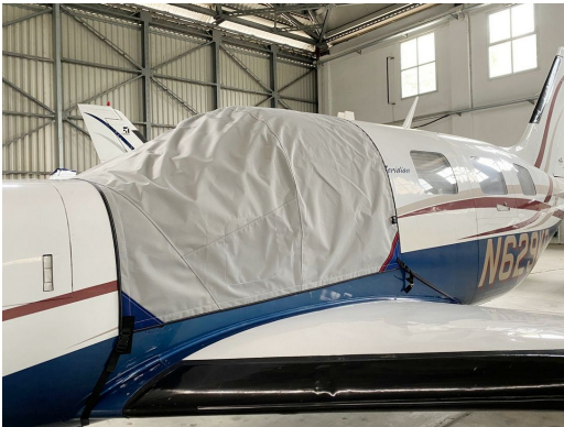
Piper PA-46-500TP Travel Cover Cockpit Cover

Travel Covers are made with Silver Solution-Dyed Polyester fabric and only lined over the windshield to save weight. The material is lightweight and more compact for easy stowage in the aircraft. The polyester material is water resistant, but only intended for occasional use outside. We also have an ultra lightweight material available for fitted hangar dust covers. For daily outdoor use, the non-travel Sunbrella Cover is the best choice.