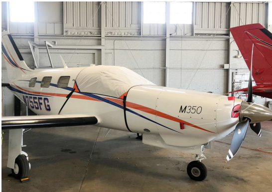
Piper PA 46-350P Cockpit Cover