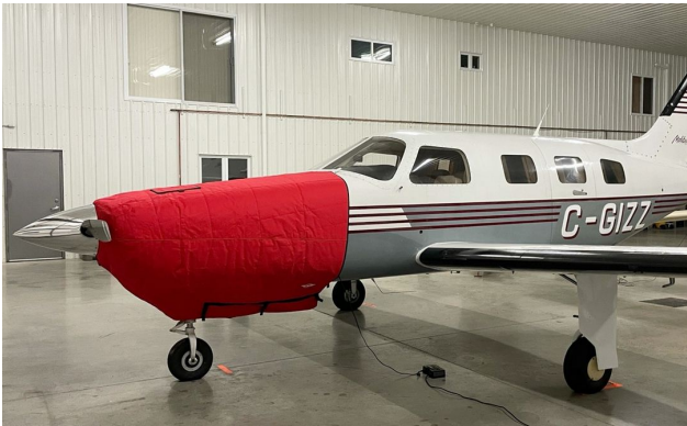
Malibu PA-46-310P Insulated Engine Cover

This cover type is made from Silver Acrylic Sunbrella canvas and is 100% lined with a soft and smooth microfiber. Bruce's Custom Covers developed this material combination especially for aircraft protection. The outer material is medium weight and treated for water resistance, UV resistance and anti-static buildup. The inner lining is a very soft and smooth microfiber to prevent scratching. The material is very reflective, and tests show that the cabin interior temperature can be reduced to near-ambient temperature on the hottest of days. It is water, ice and snow repellent, yet breathable to allow moisture to escape from between the cover and the aircraft surface.