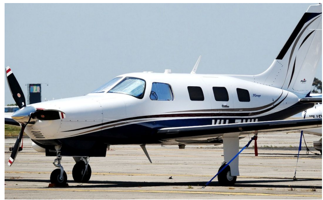
Piper PA-46-350P Mirage, Matrix, JetProp Cockpit Heatshields