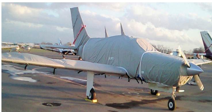
Piper PA-46 Malibu Complete Cover Set