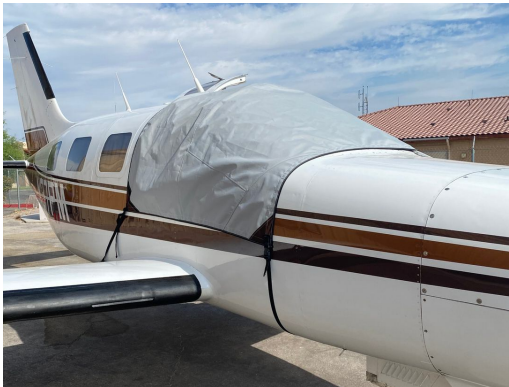
Piper PA46-310P Travel Weight Cockpit Cover

This cover type is made from Silver Acrylic Sunbrella canvas and is 100% lined with a soft and smooth microfiber. Bruce's Custom Covers developed this material combination especially for aircraft protection. The outer material is medium weight and treated for water resistance, UV resistance and anti-static buildup. The inner lining is a very soft and smooth microfiber to prevent scratching. The material is very reflective, and tests show that the cabin interior temperature can be reduced to near-ambient temperature on the hottest of days. It is water, ice and snow repellent, yet breathable to allow moisture to escape from between the cover and the aircraft surface.