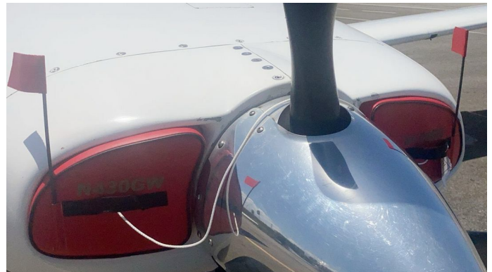
Piper PA-46 Engine Inlet Plugs