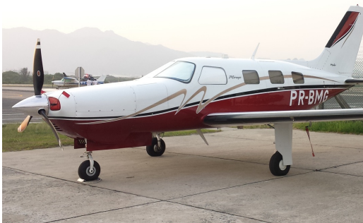
Piper Malibu/Mirage Engine Plugs, Cockpit HeatShields

Engine Inlet Plugs are custom fit for your Piper PA-46-350P Mirage, Matrix, JetProp intakes, made with heavy-duty vinyl material, and stuffed with a single block of sculpted urethane foam. Each plug has a zipper that allows the foam to be removed and dried if necessary. Engine plugs have warning flags that are visible from the cockpit or 'remove before flight' streamers sewn onto the face of the plugs. Most plugs are imprinted with the aircraft registration number in black for an extra charge. Storage bag NOT included. Engine plugs may be inserted after flight when the engine is still warm. Engine Inlet Plugs are commonly referred to as Cowl Plugs, Intake Plugs, Cowl Blocks, Engine Blocks, and Engine Bungs.