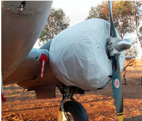
Beech D-18 Engine Covers, Center Section Oil Cooler Inlet Plugs, and Pitot Covers

This cover type is made from Silver Acrylic Sunbrella canvas and is 100% lined with a soft and smooth microfiber. Bruce's Custom Covers developed this material combination especially for aircraft protection. The outer material is medium weight and treated for water resistance, UV resistance and anti-static buildup. The inner lining is a very soft and smooth microfiber to prevent scratching. The material is very reflective, and tests show that the cabin interior temperature can be reduced to near-ambient temperature on the hottest of days. It is water, ice and snow repellent, yet breathable to allow moisture to escape from between the cover and the aircraft surface.