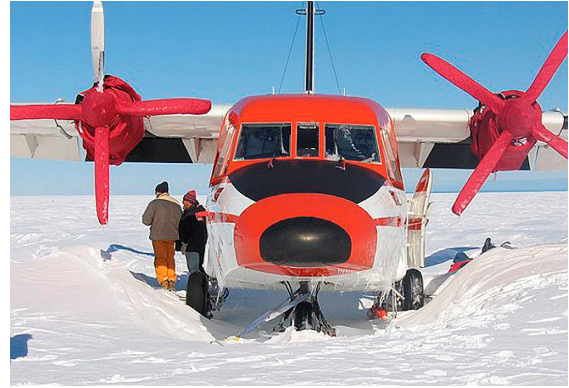
Casa 212 Insulated Engine & Propeller/Spinner Covers