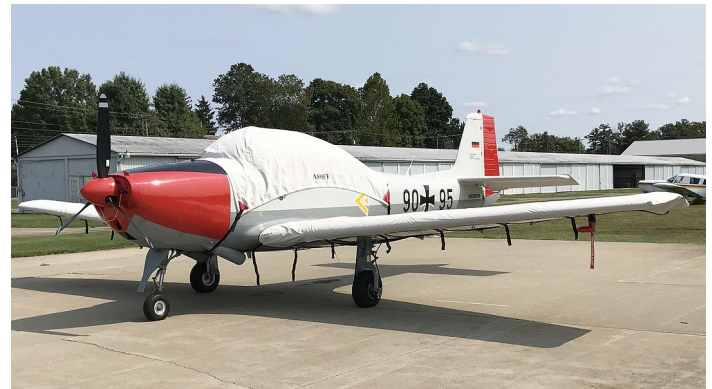
Focke Wulf F149 Canopy Cover, Wing Covers, Engine Plugs