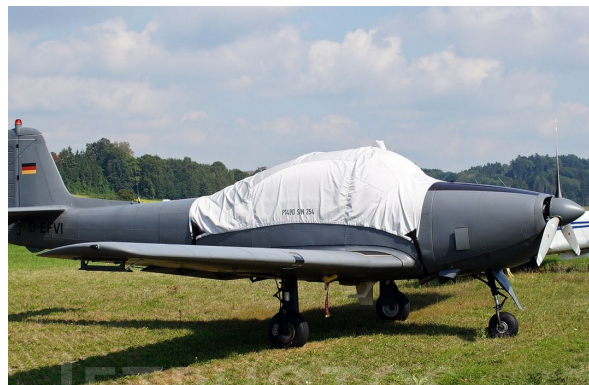
Piaggio P-149 Canopy Cover