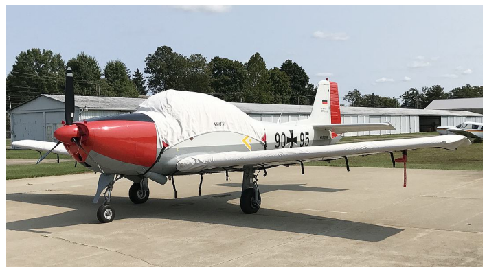
Focke Wulf F149 Canopy Cover, Wing Covers, Engine Plugs