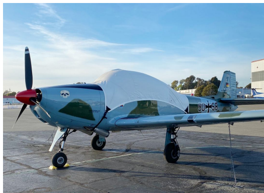
Focke Wulf 149 Trainer Canopy Cover

Cover and Engine Cover. This cover will enclose the engine cowl and will extend aft to cover all of the windows. This cover type is made from Silver Acrylic Sunbrella canvas and is 100% lined with a soft and smooth microfiber. Bruce's Custom Covers developed this material combination especially for aircraft protection. The outer material is medium weight and treated for water resistance, UV resistance and anti-static buildup. The inner lining is a very soft and smooth microfiber to prevent scratching. The material is very reflective, and tests show that the cabin interior temperature can be reduced to near-ambient temperature on the hottest of days. It is water, ice and snow repellent, yet breathable to allow moisture to escape from between the cover and the aircraft surface.