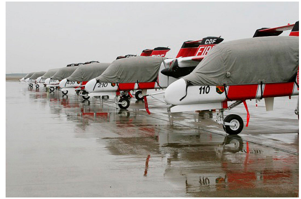
Rockwell OV-10 Canopy Covers