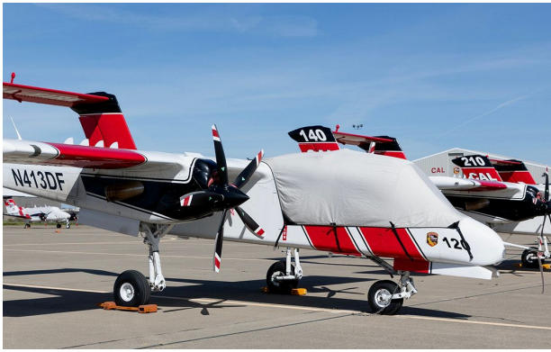
Rockwell OV-10A Bronco Cockpit Cover