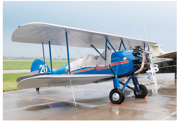
Waco ASO Canopy Cover