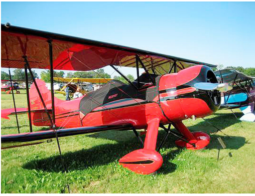
Waco UPF7 Canopy Cover