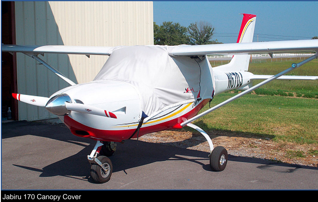
Jabiru 170 Canopy Cover