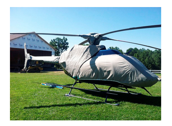
Bell 407 Covers: Bubble, Insulated Engine, Rotor Mast, Blades, Tailboom, Vertical Stabilizer and Tail Rotor