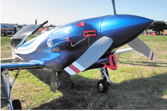
Nemesis NXT Engine Inlet Plug set

Engine Inlet Plugs are custom fit for your Nemesis NXT intakes, made with heavy-duty vinyl material, and stuffed with a single block of sculpted urethane foam. Each plug has a zipper that allows the foam to be removed and dried if necessary. Engine plugs have warning flags that are visible from the cockpit or 'remove before flight' streamers sewn onto the face of the plugs. Most plugs are imprinted with the aircraft registration number in black for an extra charge. Storage bag NOT included. Engine plugs may be inserted after flight when the engine is still warm. Engine Inlet Plugs are commonly referred to as Cowl Plugs, Intake Plugs, Cowl Blocks, Engine Blocks, and Engine Bungs.