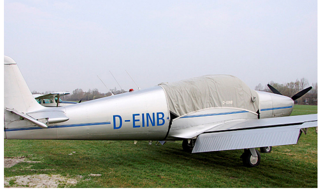
Navion Rangemaster Canopy Cover