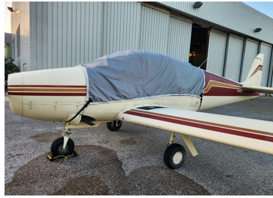
Navion Rangemaster Travel Cover, Light Weight Canopy Cover, (Super Slope windshield)