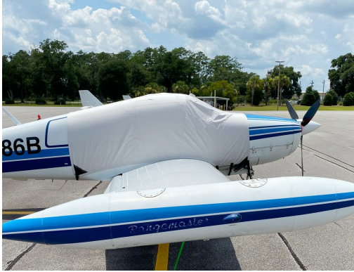
Navion Rangemaster Extended Canopy Cover

This cover type is made from Silver Acrylic Sunbrella canvas and is 100% lined with a soft and smooth microfiber. Bruce's Custom Covers developed this material combination especially for aircraft protection. The outer material is medium weight and treated for water resistance, UV resistance and anti-static buildup. The inner lining is a very soft and smooth microfiber to prevent scratching. The material is very reflective, and tests show that the cabin interior temperature can be reduced to near-ambient temperature on the hottest of days. It is water, ice and snow repellent, yet breathable to allow moisture to escape from between the cover and the aircraft surface.