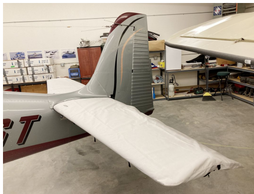
Navion Rangemaster Horizontal Stabilizer Covers