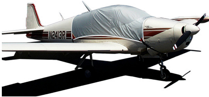
Covers & Plugs for the Navion Rangemaster

This cover type is made from Silver Acrylic Sunbrella canvas and is 100% lined with a soft and smooth microfiber. Bruce's Custom Covers developed this material combination especially for aircraft protection. The outer material is medium weight and treated for water resistance, UV resistance and anti-static buildup. The inner lining is a very soft and smooth microfiber to prevent scratching. The material is very reflective, and tests show that the cabin interior temperature can be reduced to near-ambient temperature on the hottest of days. It is water, ice and snow repellent, yet breathable to allow moisture to escape from between the cover and the aircraft surface.