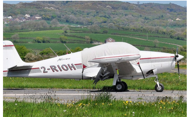
Navion Rangemaster Canopy Cover