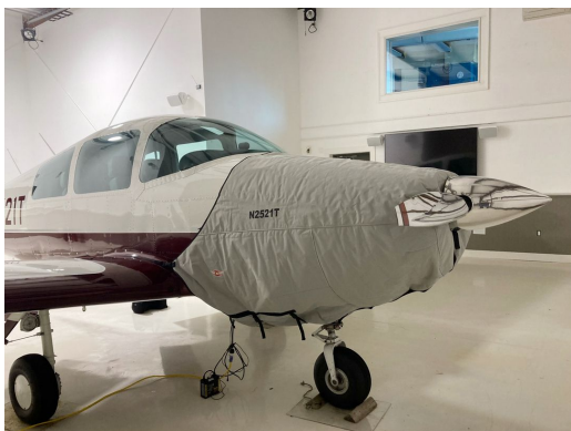
NAVION H Insulated Engine Cover

This cover type is made from Silver Acrylic Sunbrella canvas and is 100% lined with a soft and smooth microfiber. Bruce's Custom Covers developed this material combination especially for aircraft protection. The outer material is medium weight and treated for water resistance, UV resistance and anti-static buildup. The inner lining is a very soft and smooth microfiber to prevent scratching. The material is very reflective, and tests show that the cabin interior temperature can be reduced to near-ambient temperature on the hottest of days. It is water, ice and snow repellent, yet breathable to allow moisture to escape from between the cover and the aircraft surface.