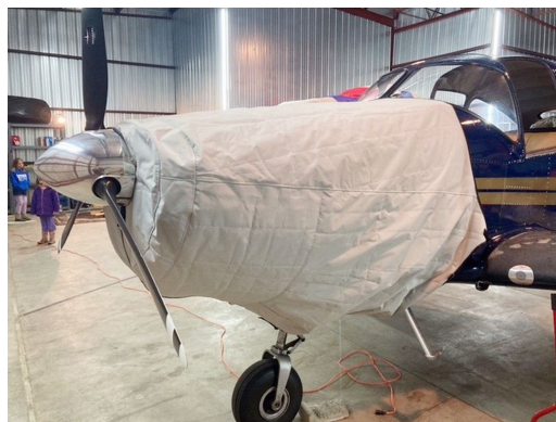
Navion Insulated Engine Cover