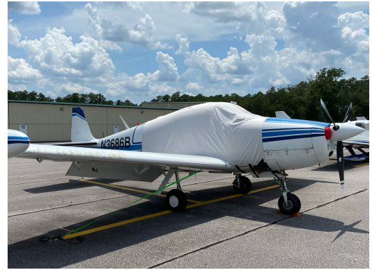
Navion Rangemaster Extended Canopy Cover