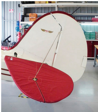
Waco UPF-7 Horizontal Stab. Cover

WINTER USE MATERIAL - Made with Solution-Dyed Polyester fabric, this option is intended for seasonal use to aid in deicing, rain mitigation, or for occasional travel. The material is lighter and more compact, but more susceptible to UV damage and may have a shorter useful life if used continuously outside than the all-year use material.