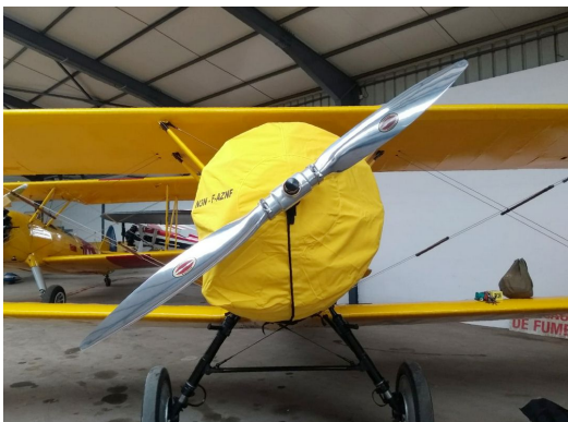
N3N Engine Cover

This cover type is made from Silver Acrylic Sunbrella canvas and is 100% lined with a soft and smooth microfiber. Bruce's Custom Covers developed this material combination especially for aircraft protection. The outer material is medium weight and treated for water resistance, UV resistance and anti-static buildup. The inner lining is a very soft and smooth microfiber to prevent scratching. The material is very reflective, and tests show that the cabin interior temperature can be reduced to near-ambient temperature on the hottest of days. It is water, ice and snow repellent, yet breathable to allow moisture to escape from between the cover and the aircraft surface.