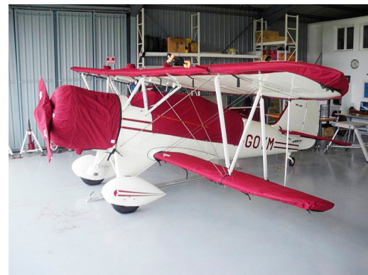
Waco UPF-7 Canopy, Wings, Stab's, Engine, Prop Covers