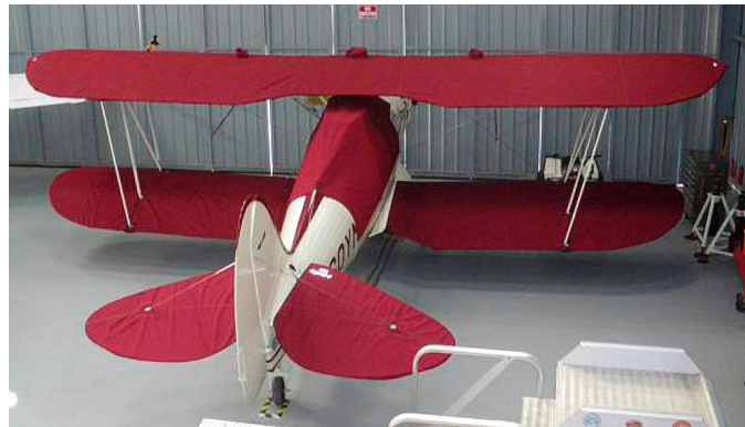
Waco UPF-7 Upper/Lower Wing Cover, Horizontal Stabilizer Cover, & Canopy Cover