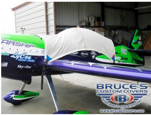
MX-2 Canopy Cover