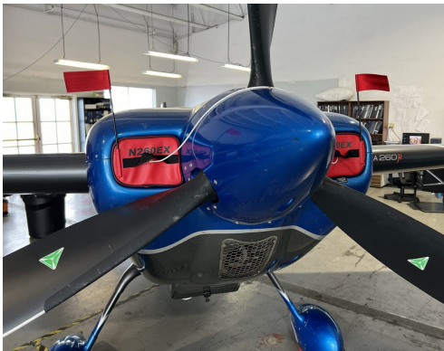
Extra 260 Engine Inlet Plugs