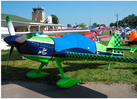
MX-2 Canopy Cover