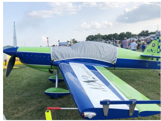
MX2 Lightweight Travel Canopy Cover