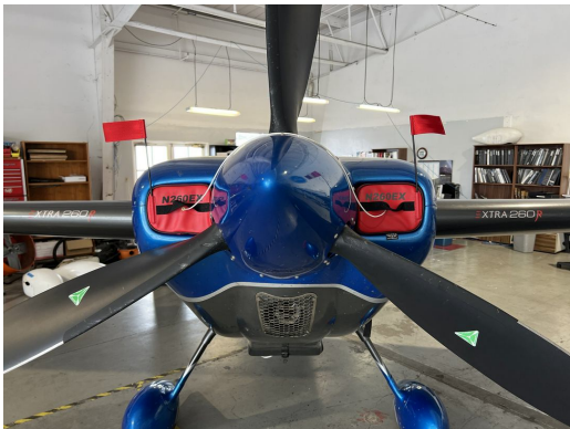
Extra 260 Engine Inlet Plugs

Engine Inlet Plugs are custom fit for your MXR Technologies MXS & MX2 intakes, made with heavy-duty vinyl material, and stuffed with a single block of sculpted urethane foam. Each plug has a zipper that allows the foam to be removed and dried if necessary. Engine plugs have warning flags that are visible from the cockpit or 'remove before flight' streamers sewn onto the face of the plugs. Most plugs are imprinted with the aircraft registration number in black for an extra charge. Storage bag NOT included. Engine plugs may be inserted after flight when the engine is still warm. Engine Inlet Plugs are commonly referred to as Cowl Plugs, Intake Plugs, Cowl Blocks, Engine Blocks, and Engine Bungs.