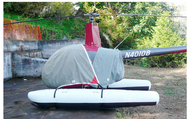
Robinson R-22 Standard Bubble Cover & Engine Cover