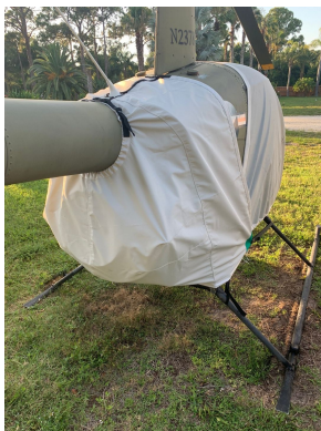
Robinson R-22 Engine Cover

Bruce's Autogyro MTO Sport, 2010, 2017 Gyrocopter Blade Covers are made of medium-weight Solution-Dyed Polyester and designed to avoid trim tabs or wicks. You can install Blade Covers from the ground with the aid of a lightweight rope attached to the open end. Covers are cinched tight at the blade root with straps and quick-release plastic buckles. The Cold Weather Blade Covers are fitted with full-length zippers and optional deice "boots" designed to accept a preheater hose; a small opening at the tip of the cover allows for some air circulation and drainage in freezing weather. Some part numbers have features for an extra charge.