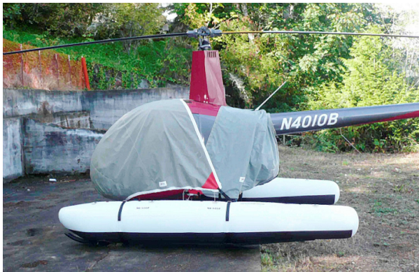
Robinson R-22 Standard Bubble Cover & Engine Cover

Bruce's Autogyro MTO Sport, 2010, 2017 Gyrocopter Blade Covers are made of medium-weight Solution-Dyed Polyester and designed to avoid trim tabs or wicks. You can install Blade Covers from the ground with the aid of a lightweight rope attached to the open end. Covers are cinched tight at the blade root with straps and quick-release plastic buckles. The Cold Weather Blade Covers are fitted with full-length zippers and optional deice "boots" designed to accept a preheater hose; a small opening at the tip of the cover allows for some air circulation and drainage in freezing weather. Some part numbers have features for an extra charge.