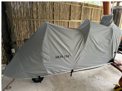
MTO Sport Travel Weight Canopy/Nose Cover

Travel Covers are made with Silver Solution-Dyed Polyester fabric and fully lined over the entire cover. The material is lightweight and more compact for easy stowage in the aircraft. The polyester material is water resistant, but only intended for occasional use outside. We also have an ultra lightweight material available for fitted hangar dust covers. For daily outdoor use, the non-travel Sunbrella Cover is the best choice.