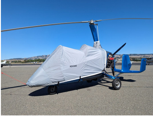
Autogyro MTOSPORT Travel Cover, Light Weight Canopy/Nose Cover

Travel Covers are made with Silver Solution-Dyed Polyester fabric and fully lined over the entire cover. The material is lightweight and more compact for easy stowage in the aircraft. The polyester material is water resistant, but only intended for occasional use outside. We also have an ultra lightweight material available for fitted hangar dust covers. For daily outdoor use, the non-travel Sunbrella Cover is the best choice.