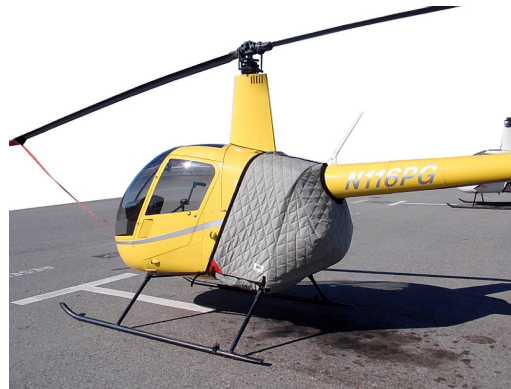
Robinson R-22 Insulated Engine Cover (also covers bottom) & Front Blade Tie-down