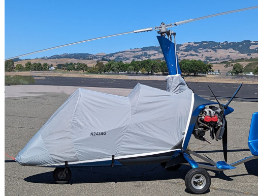
Autogyro MTOSPORT Travel Cover, Light Weight Canopy/Nose Cover