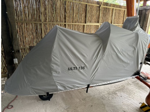
MTO Sport Travel Weight Canopy/Nose Cover

Travel Covers are made with Silver Solution-Dyed Polyester fabric and fully lined over the entire cover. The material is lightweight and more compact for easy stowage in the aircraft. The polyester material is water resistant, but only intended for occasional use outside. We also have an ultra lightweight material available for fitted hangar dust covers. For daily outdoor use, the non-travel Sunbrella Cover is the best choice.