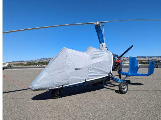
Autogyro MTOSPORT Travel Cover, Light Weight Canopy/Nose Cover