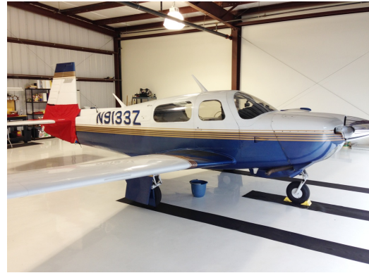
Mooney Tailcone Cover