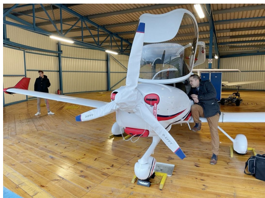
DA40 NG Engine Plugs

Designed to prevent damage to the aircraft extremities in crowded hangars, these products are made of bright red Naugahyde and thickly padded with a sandwich of closed cell foam.