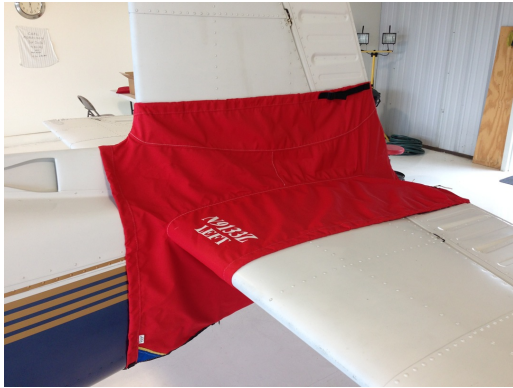
Mooney Tailcone Cover

WINTER USE MATERIAL - Made with Solution-Dyed Polyester fabric, this option is intended for seasonal use to aid in deicing, rain mitigation, or for occasional travel. The material is lighter and more compact, but more susceptible to UV damage and may have a shorter useful life if used continuously outside than the all-year use material.