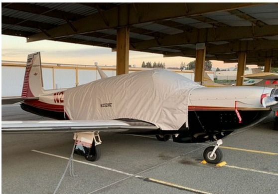
Mooney M20K Extended Canopy Cover

This cover type is made from Silver Acrylic Sunbrella canvas and is 100% lined with a soft and smooth microfiber. Bruce's Custom Covers developed this material combination especially for aircraft protection. The outer material is medium weight and treated for water resistance, UV resistance and anti-static buildup. The inner lining is a very soft and smooth microfiber to prevent scratching. The material is very reflective, and tests show that the cabin interior temperature can be reduced to near-ambient temperature on the hottest of days. It is water, ice and snow repellent, yet breathable to allow moisture to escape from between the cover and the aircraft surface.