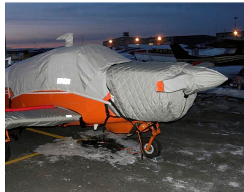
Mooney M20F Prop/Spinner, Insulated Engine, Wing and Canopy Covers