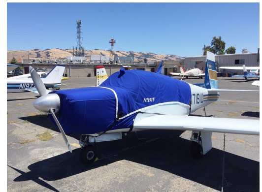
Mooney M20 Canopy & Engine Cover