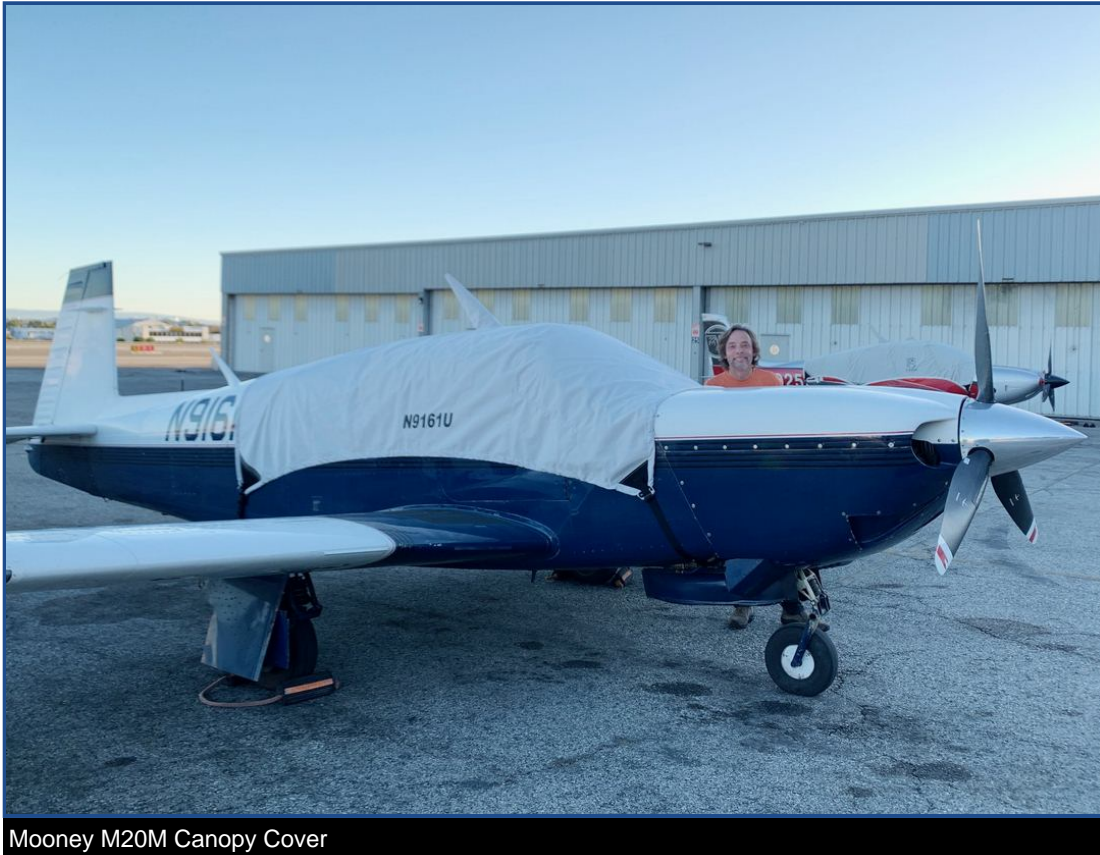
Mooney M20M Canopy Cover