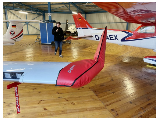
Diamond DA-40 Wingtip Pads