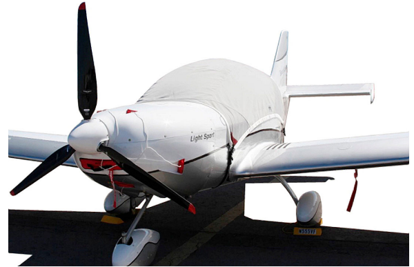
Sportcruiser Canopy Cover & Plugs