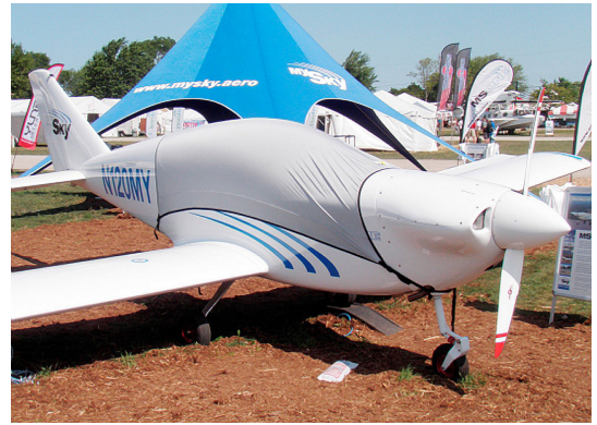
Mysky Fly-Away Travel Cover