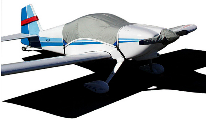
Canopy Cover, Prop Cover