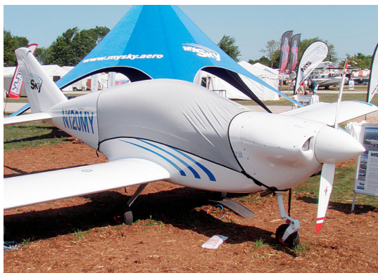
Mysky Fly-Away Travel Cover

Travel Covers are made with Silver Solution-Dyed Polyester fabric and only lined over the windshield to save weight. The material is lightweight and more compact for easy stowage in the aircraft. The polyester material is water resistant, but only intended for occasional use outside. We also have an ultra lightweight material available for fitted hangar dust covers. For daily outdoor use, the non-travel Sunbrella Cover is the best choice.