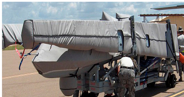
MQ1 Fuselage and Wing Covers