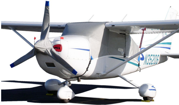
Cessna 182 Canopy Cover, Engine Plugs, 3-Blade Prop Cover

This cover type is made from Silver Acrylic Sunbrella canvas and is 100% lined with a soft and smooth microfiber. Bruce's Custom Covers developed this material combination especially for aircraft protection. The outer material is medium weight and treated for water resistance, UV resistance and anti-static buildup. The inner lining is a very soft and smooth microfiber to prevent scratching. The material is very reflective, and tests show that the cabin interior temperature can be reduced to near-ambient temperature on the hottest of days. It is water, ice and snow repellent, yet breathable to allow moisture to escape from between the cover and the aircraft surface.