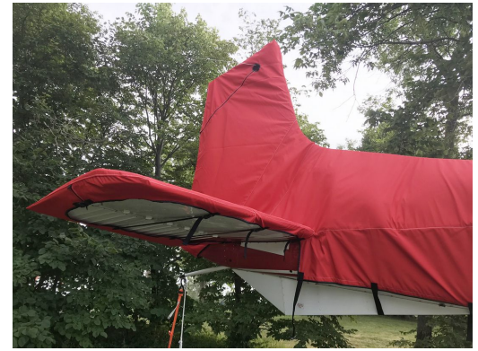
Cessna 185 Empennage Cover