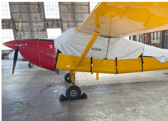
Murphy Super Rebel Canopy Cover

This cover type is made from Silver Acrylic Sunbrella canvas and is 100% lined with a soft and smooth microfiber. Bruce's Custom Covers developed this material combination especially for aircraft protection. The outer material is medium weight and treated for water resistance, UV resistance and anti-static buildup. The inner lining is a very soft and smooth microfiber to prevent scratching. The material is very reflective, and tests show that the cabin interior temperature can be reduced to near-ambient temperature on the hottest of days. It is water, ice and snow repellent, yet breathable to allow moisture to escape from between the cover and the aircraft surface.