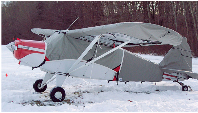
Piper Clipper Canopy Cover, Empennage & Wing Covers, Engine Plugs