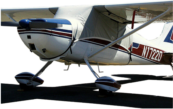
Over-the-Top Canopy Cover

Covers developed this material combination especially for aircraft protection. The outer material is medium weight and treated for water resistance, UV resistance and anti-static buildup. The inner lining is a very soft and smooth microfiber to prevent scratching. The material is very reflective, and tests show that the cabin interior temperature can be reduced to near-ambient temperature on the hottest of days. It is water, ice and snow repellent, yet breathable to allow moisture to escape from between the cover and the aircraft surface.