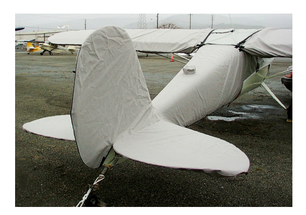
Cessna 120 Empennage Cover

WINTER USE MATERIAL - Made with Solution-Dyed Polyester fabric, this option is intended for seasonal use to aid in deicing, rain mitigation, or for occasional travel. The material is lighter and more compact, but more susceptible to UV damage and may have a shorter useful life if used continuously outside than the all-year use material.