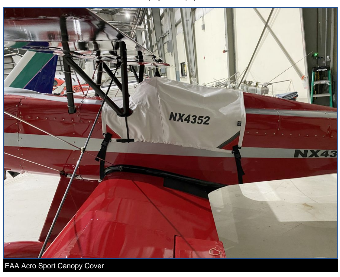
Section 1: Canopy/Cockpit/Fuselage Covers

Canopy Covers help reduce damage to your airplane's upholstery and avionics caused by excessive heat, and they can eliminate problems caused by leaking door and window seals. They keep the windshield and window surfaces clean and help prevent vandalism and theft.