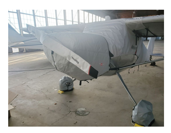
Cessna 140 Canopy, Wings, Prop, Tires & Empennage Covers