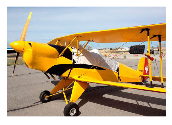
Bucker Jungmann Canopy Cover