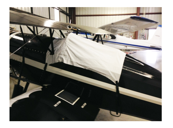
Rose Parrakeet Canopy Cover (test fit cover)